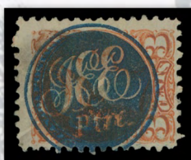
Intaglio cursive "JEE P'tre" in dark blue