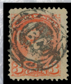
Extremely rare Union B.C. intaglio