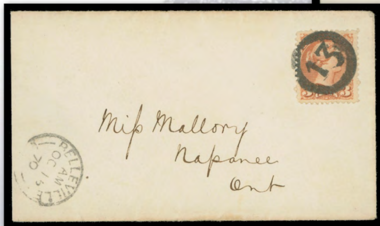
Belleville "13" single-ring numeral on clean 1870 cover