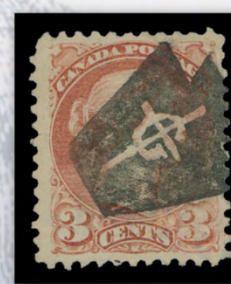
Superb fraternal / masonic intaglio

This impressive collection was formed with emphasis on rarity and clarity. Elaborate and seldom seen geometrics, letters and numerals will be sold either singly or in logical groups. Contact us today for further information.