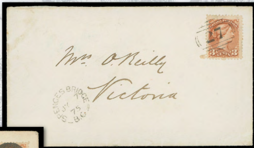
British Columbia grid '27' (Spence's Bridge) on superb 1875 cover