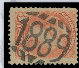
Very rare "1889"