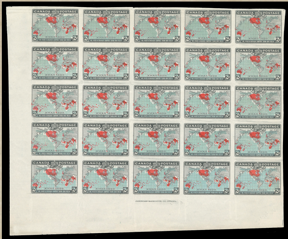
Lot 452 – Realized $16,590