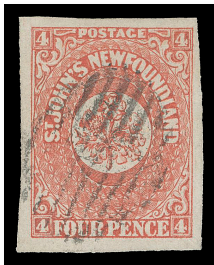
Lot 251 – Realized $5,035