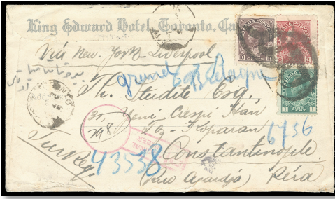
Lot 530 – Realized $1,300