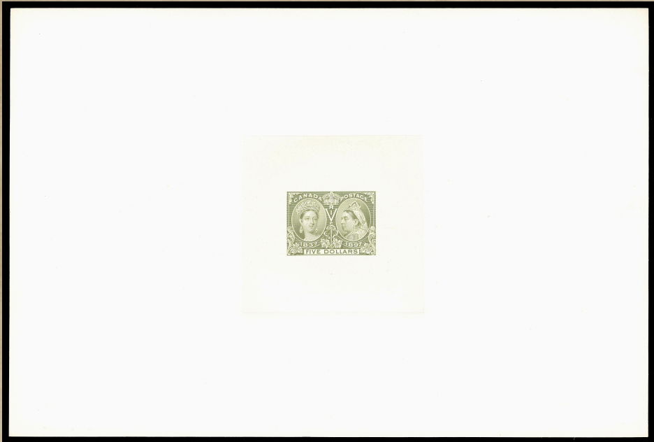
Lot 403 – Realized $28,440