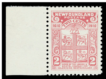
Lot 270 – Realized $2,845