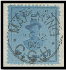
Lot 45 – Realized $1,480