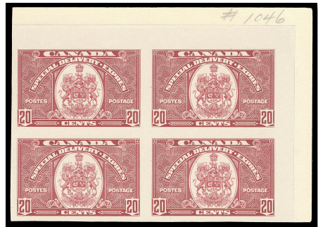
Lot 697 – Realized $3,435