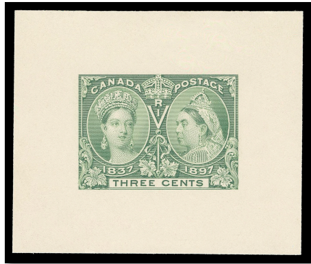
Lot 406 – Realized $2,845