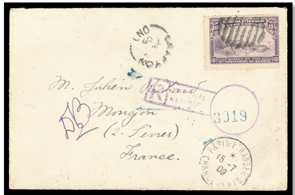
Lot 470 – Realized $2,015