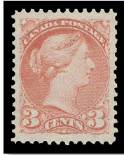
Lot 389 – Realized $1,775