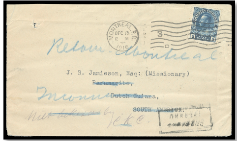
Lot 540 – Realized $1,005