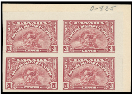
Lot 693 – Realized $5,625