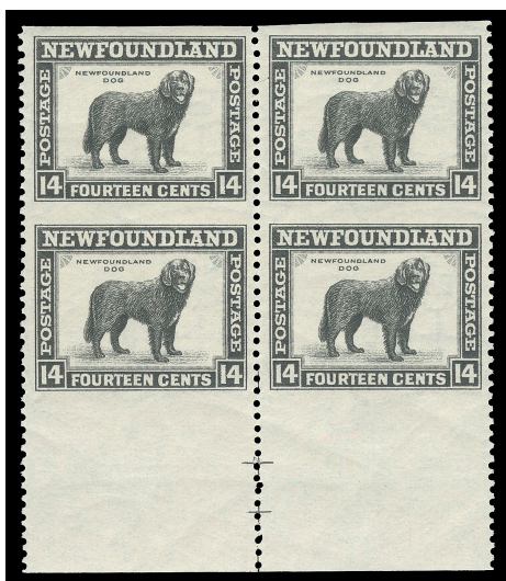
Lot 294 – Realized $1,540