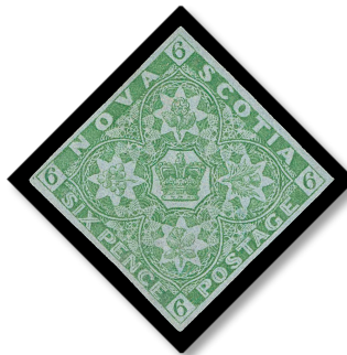
Lot 238 – Realized $8,295