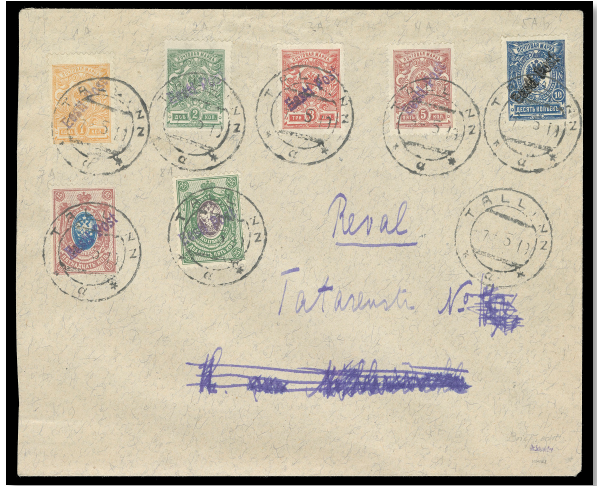
Lot 72 – Realized $4,760