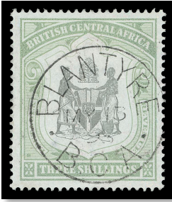
Lot 26 – Realized $385

Realizations below do not include the 18.5% buyer's premium.