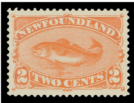
Lot 262 – Realized $385