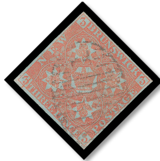
Lot 226 – Realized $1,125