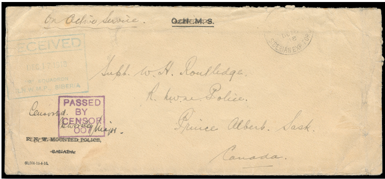
Lot 547 – Realized $860