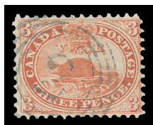
Lot 359 – Realized $1,245