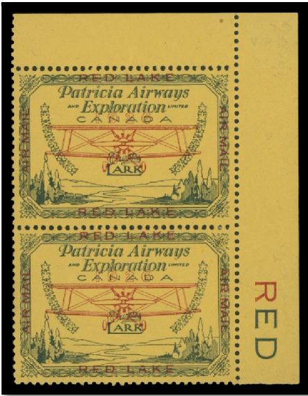
Lot 385 Realized $4,440