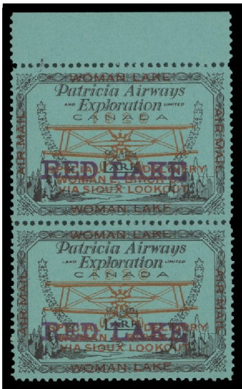
Lot 488 Realized $9,480