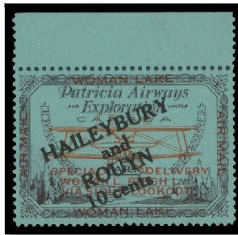
Lot 485 Realized $6,515