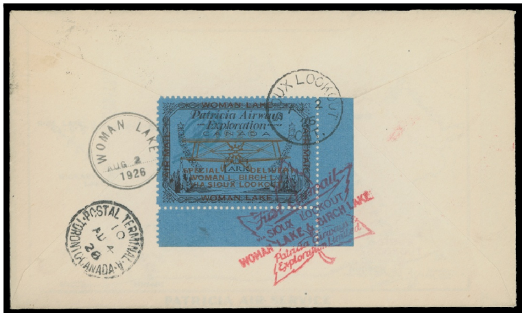
Lot 493 Realized $2,725