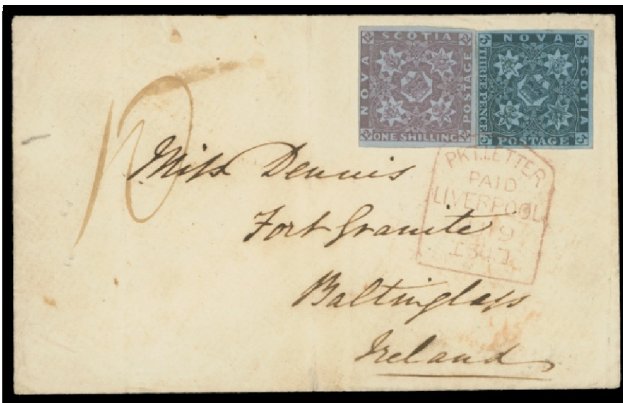
Lot 663 Realized $38,510