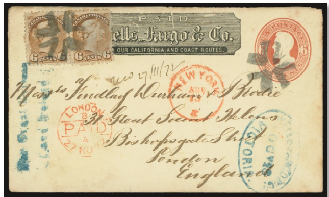
Lot 1056 Realized $6,810