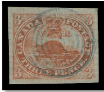
Lot 884 Realized $3,200