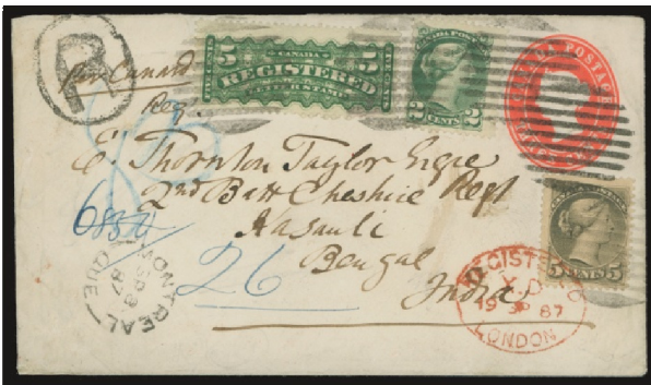
Lot 1029 Realized $5,330