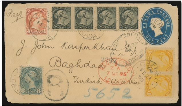
Lot 1055 Realized $2,485