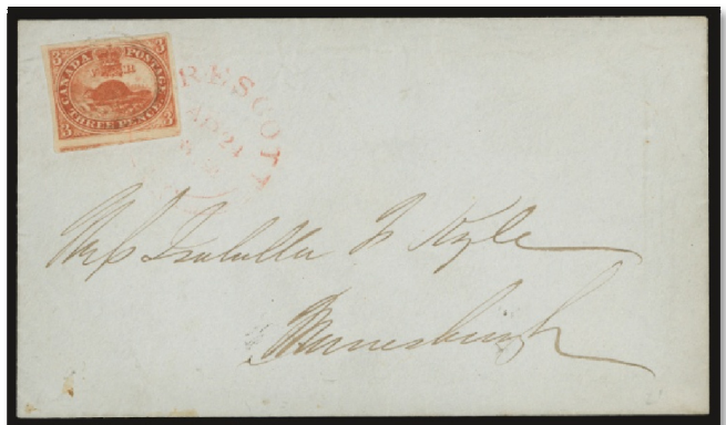
Lot 908 Realized $945