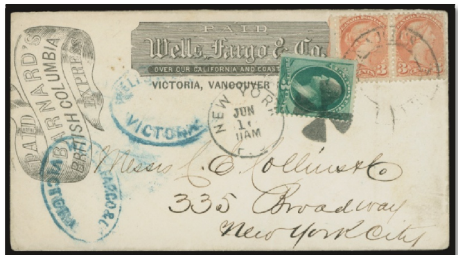
Lot 1067 Realized $8,000