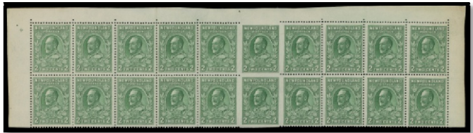
Lot 746 Realized $2,725