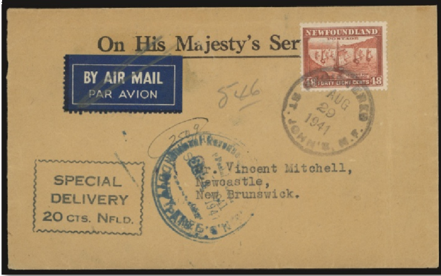
Lot 781 Realized $1,245

Realizations below do not include the 18.5% buyer's premium.