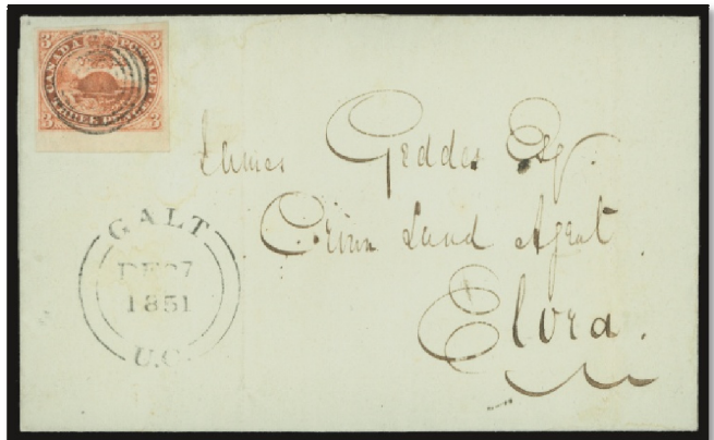
Lot 886 Realized $5,035