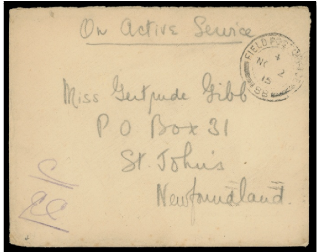
Lot 717 Realized $1,360