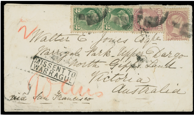
Lot 989 Realized $6,515