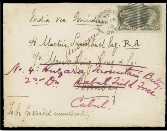
Lot 985 Realized $5,625

Realizations below do not include the 18.5% buyer's premium.