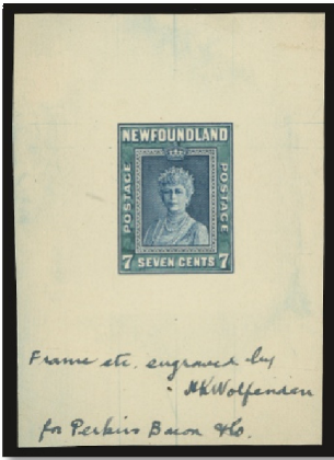
Lot 804 Realized $2,015