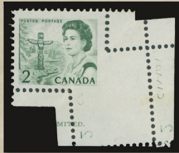
Lot 1148 Realized $1,125