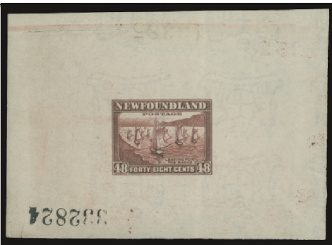
Lot 832 Realized $2,130