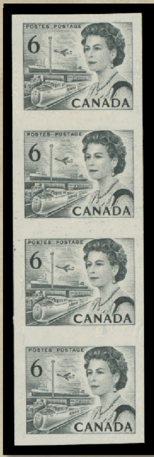
Lot 1149 Realized $6,220