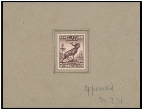
Lot 753 Realized $3,080