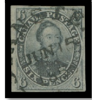
Lot 889 Realized $2,370