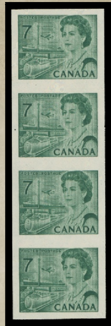
Lot 1150 Realized $2,845