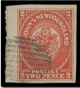
Lot 108 Realized $17,775

Realizations below do not include the 18.5% buyer's premium.