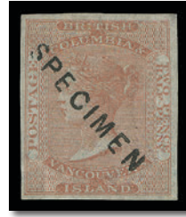
Lot 3 Realized $9,480