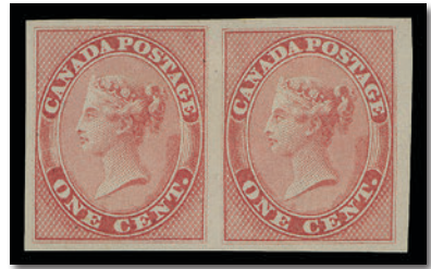
Lot 274 - Realized $7,405