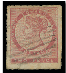
Lot 86 - Realized $34,365