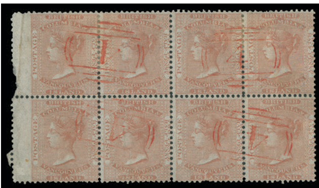
Lot 4 - Realized $4,145