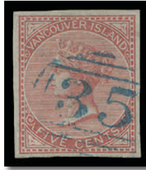
Lot 9 Realized $26,070