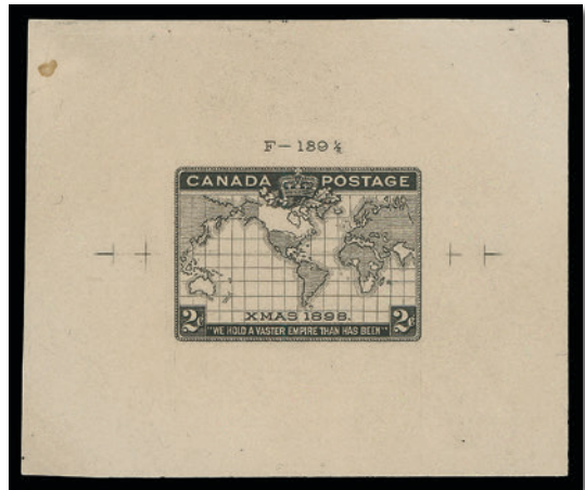
Lot 337 - Realized $8,000