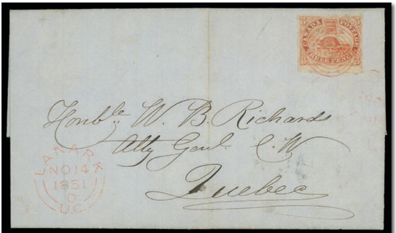
Lot 227 - Realized $4,740