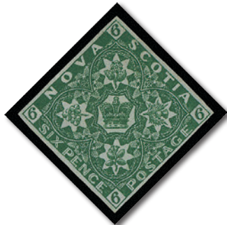
Lot 67 - Realized $27,255