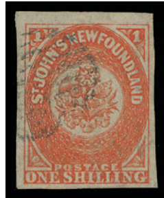
Lot 136 Realized $11,850