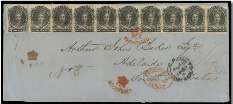
Lot 81 - Realized $14,810