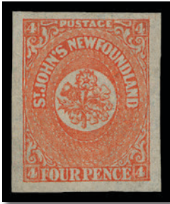
Lot 133 Realized $16,590