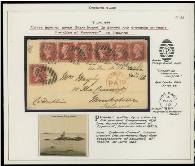
Lot 1 - Realized $7,405