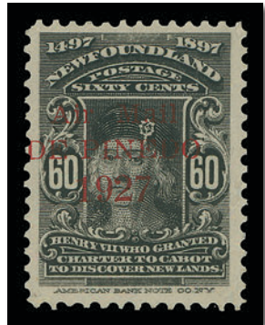
Lot 210 - Realized $47,400