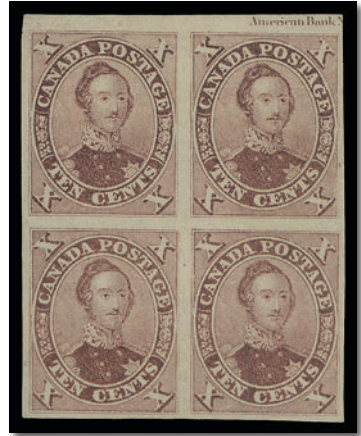
Lot 283 - Realized $44,435