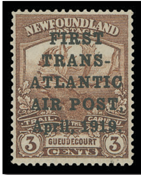
Lot 208 - Realized $44,435