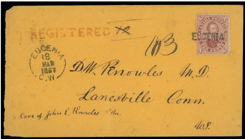
Lot 284 - Realized $3,200