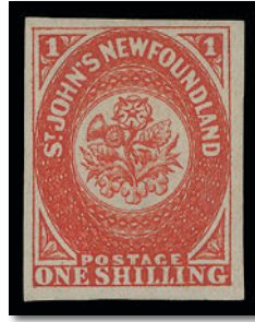
Lot 127 Realized $59,250