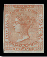
Lot 2 Realized $38,510

Realizations below do not include the 18.5% buyer's premium.