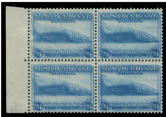
Lot 190 - Realized $11,255