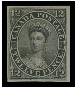
Lot 234 - Realized $183,675