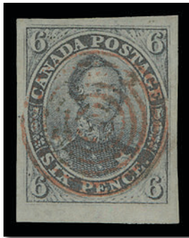
Lot 230 - Realized $5,035