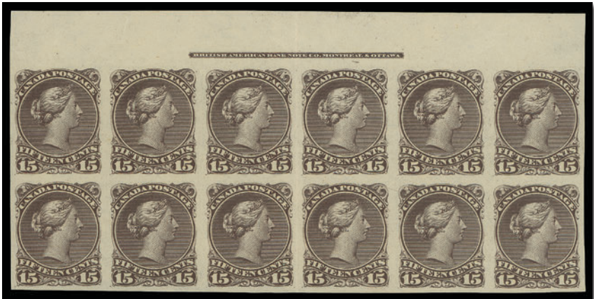
Lot 320 - Realized $16,590