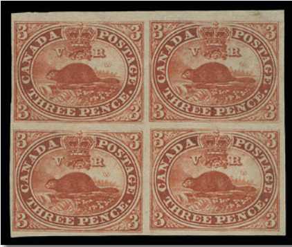
Lot 235 - Realized $13,035