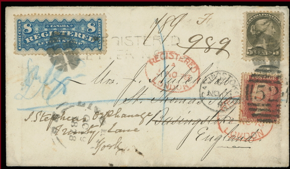
Lots 357 - Realized $9,480