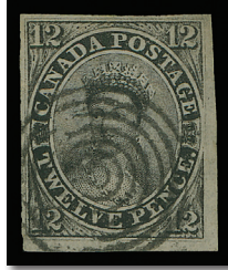
Lot 227 Realized $100,725