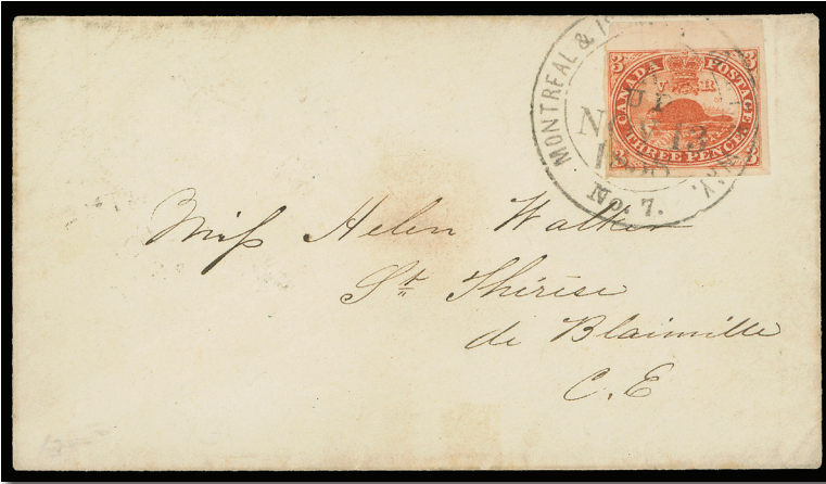
Lot 240 - Realized $4,440