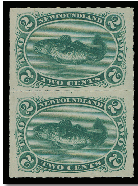
Lot 122 - Realized $7,110