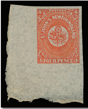
Lot 98 - Realized $16,000

Realizations below do not include the 18.5% buyer's premium.