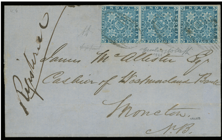
Lot 51 - Realized $6,220