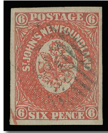
Lot 80 Realized $6,220