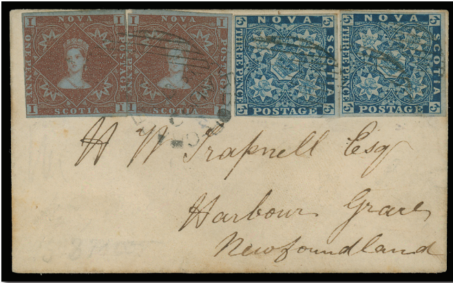
Lot 40 - Realized $8,000