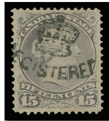
Lot 289 Realized $2,960