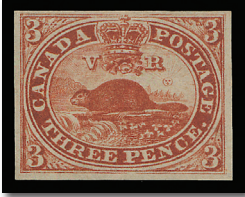
Lot 231 Realized $5,330

Realizations below do not include the 18.5% buyer's premium.