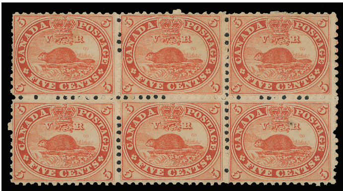
Lot 257 - Realized $12,440