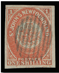
Lot 103 - Realized $14,220