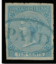
Lot 10 Realized $2,135