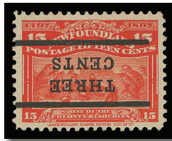
Lot 150 - Realized $5,035