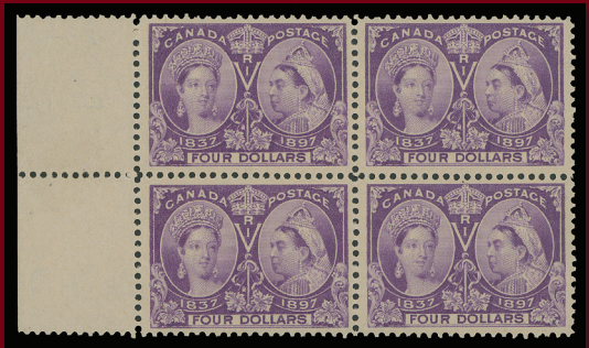
Lot 318 – Realized $11,850