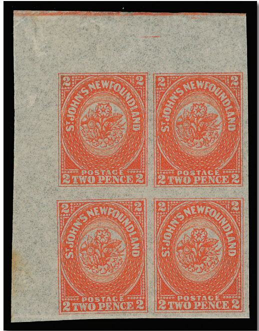
Lot 94 - Realized $10,665