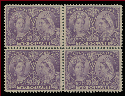
Lot 315 – Realized $14,810