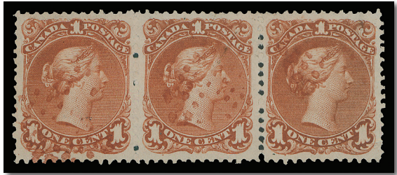
Lot 268 – Realized $2,845