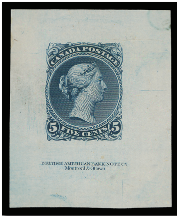
Lot 274 – Realized $17,180