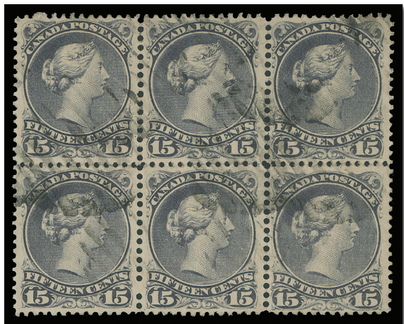
Lot 290 – Realized $10,665