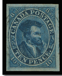
Lot 243 Realized $4,740