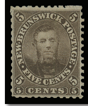
Lot 29 Realized $13,625