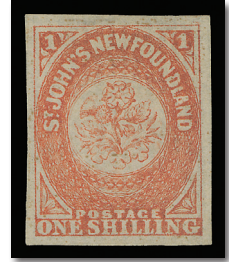
Lot 93 Realized $38,510