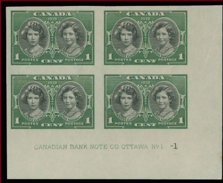
Lots 348-350 - Realized $14,810