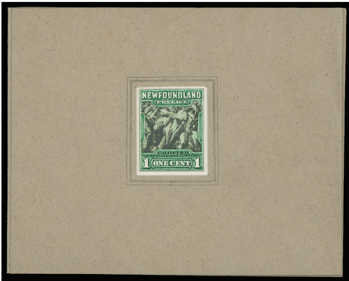
Lots 157-163 - Realized $38,510