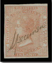
Lot 2 Realized $8,000

Realizations below do not include the 18.5% buyer's premium.