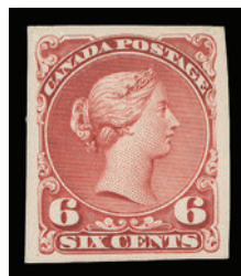
Lot 472 Realized $3,315