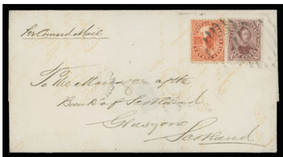
Lot 433 – Realized $4,440