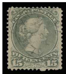
Lot 481 Realized $6,810