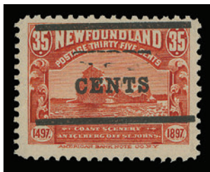
Lot 182 – Realized $3,315