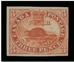
Lot 290 Realized $3,315