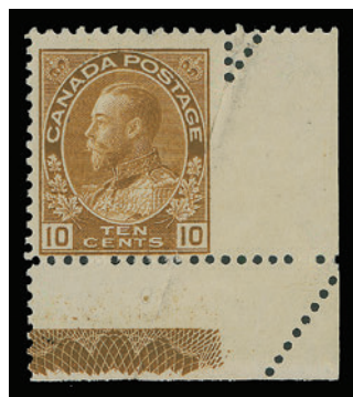
Lot 627 – Realized $5,035