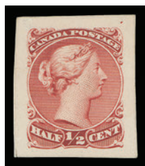
Lot 457 Realized $2,250