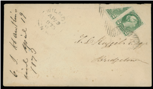
Lot 524 – Realized $3,850