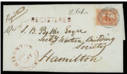
Lot 325 – Realized $1,600