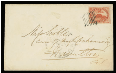
Lot 334 – Realized $3,315