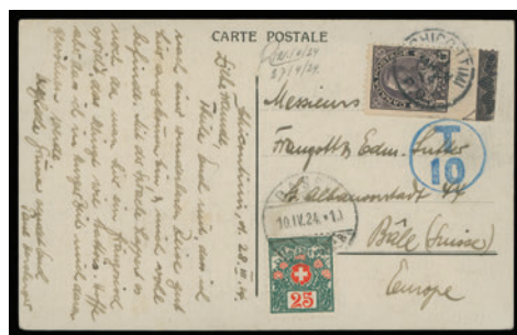
Lot 640 – Realized $885