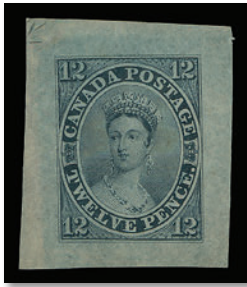
Lot 286 Realized $6,515

Realizations below do not include the 18.5% buyer's premium.