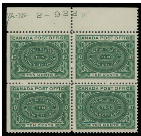
Lot 766 – Realized $1,360