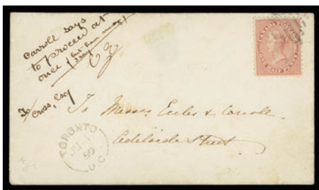
Lot 381 – Realized $4,145