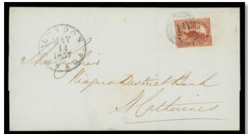
Lot 327 – Realized $1,245