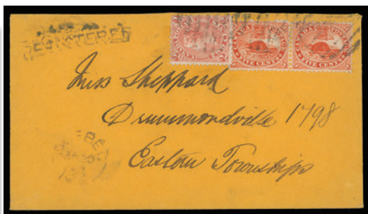
Lot 454 – Realized $2,960