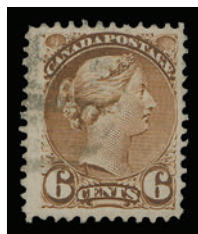
Lot 512 Realized $1,360