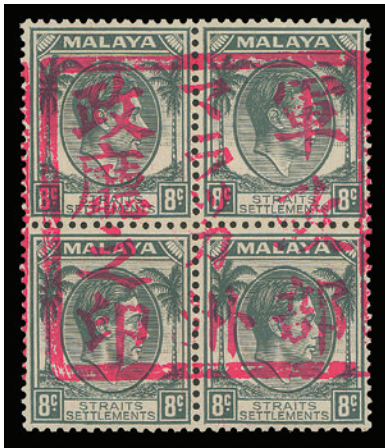
Lot 40 – Realized $1,420