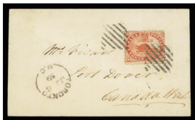
Lot 386 – Realized $2,725