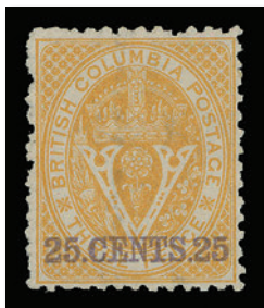
Lot 84 – Realized $3,080