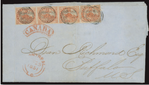
Lot 265 – Realized $11,255