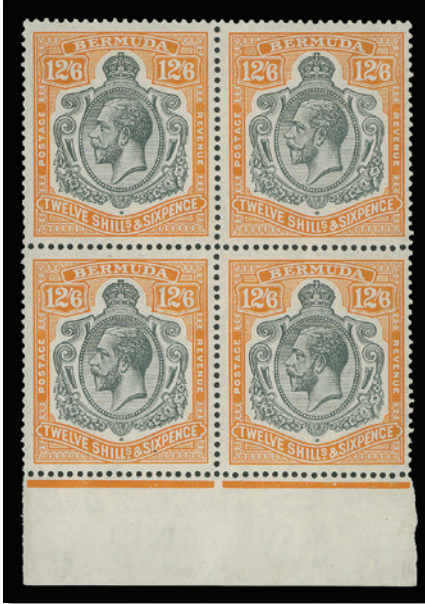
Lot 8 – Realized $1,480

Realizations below do not include the 18.5% buyer's premium.