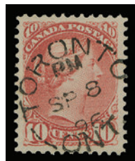
Lot 514 Realized $10,070