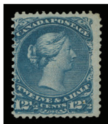
Lot 475 Realized $2,725