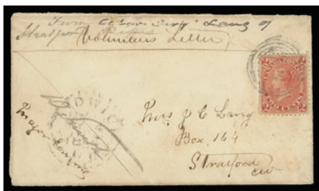
Lot 452 – Realized $5,625