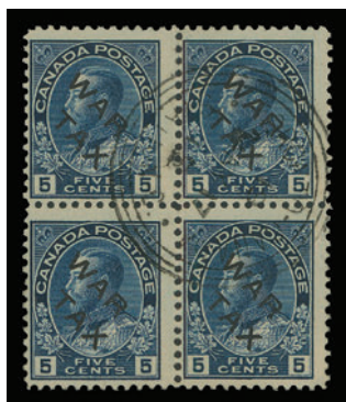
Lot 803 – Realized $680