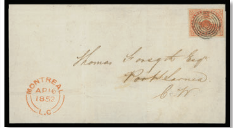
Lot 266 – Realized $4,145