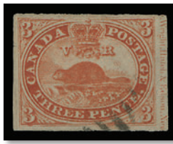
Lot 313 Realized $2,960