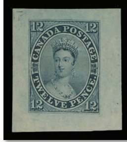
Lot 287 Realized $6,515