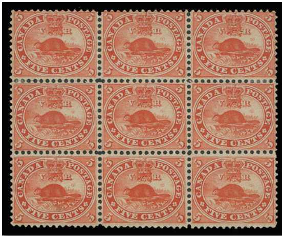
Lot 400 – Realized $18,960