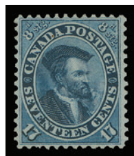
Lot 442 Realized $5,035