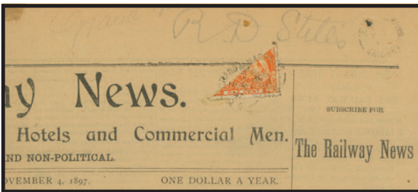
Lot 547 – Realized $7,405