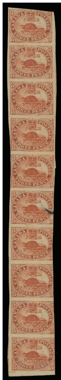
Lot 289 Realized $31,995