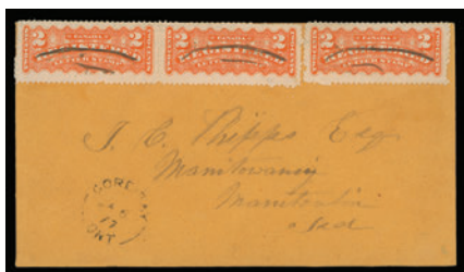
Lot 783 – Realized $3,850

Realizations below do not include the 18.5% buyer's premium.