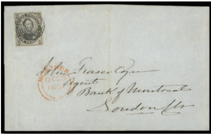
Lot 280 – Realized $3,850