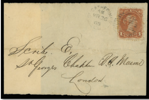
Lot 486 – Realized $4,440

Realizations below do not include the 18.5% buyer's premium.