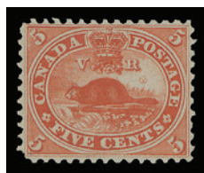
Lot 402 Realized $3,850