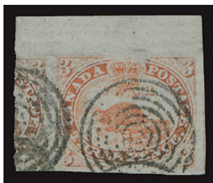
Lot 259 – Realized $2,725