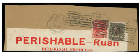
Lot 805 – Realized $620