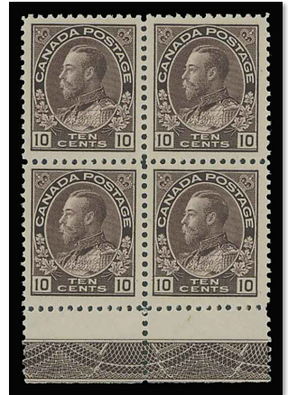
Lot 140 – Realized $5,750