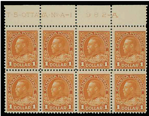
Lot 322 – Realized $5,175