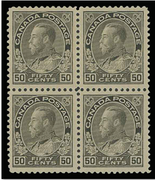
Lot 492 – Realized $2,300

Realizations below do not include the 15% buyer's premium.