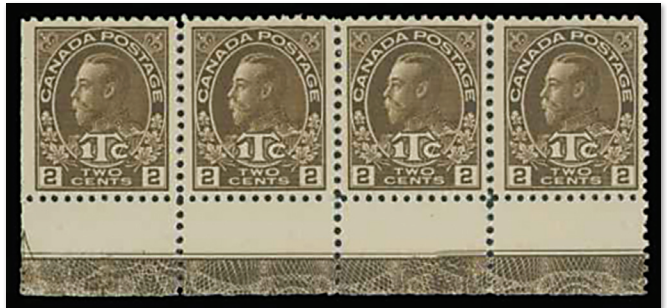
Lot 109 – Realized $14,950