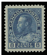
Lot 452 Realized $575