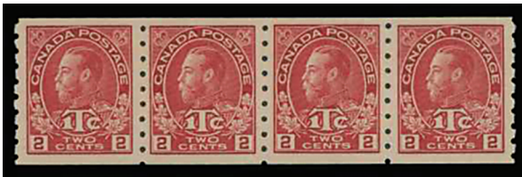
Lot 611 – Realized $2,760