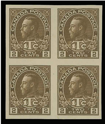
Lot 9 – Realized $5,450