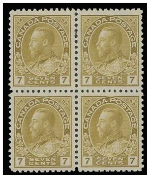
Lot 431 – Realized $5,460