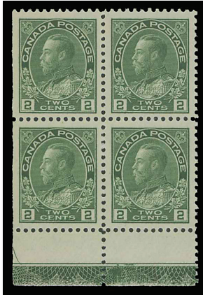
Lot 155 – Realized $10,925