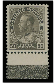
Lot 226 – Realized $9,775