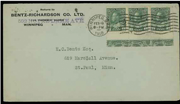
Lot 251 – Realized $775

Realizations below do not include the 15% buyer's premium.