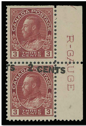
Lot 34 – Realized $1,955