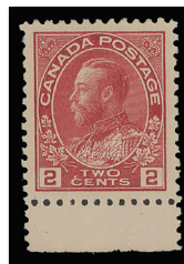
Lot 367 Realized $1,150