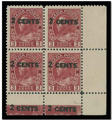
Lot 241 – Realized $4,885