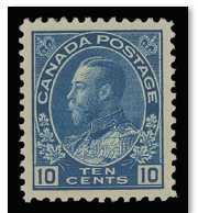
Lot 471 Realized $545