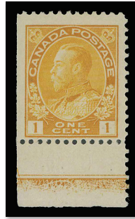
Lot 73 – Realized $6,325