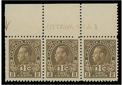
Lot 338 – Realized $5,175