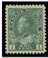
Lot 358 Realized $545