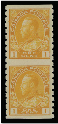
Lot 2 – Realized $3,735

Realizations below do not include the 15% buyer's premium.