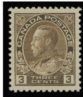
Lot 392 Realized $545