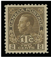
Lot 558 Realized $4,310