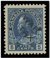
Lot 537 Realized $2,645