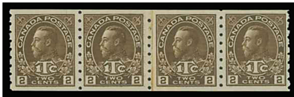
Lot 615 – Realized $1,035