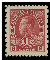
Lot 565 Realized $485