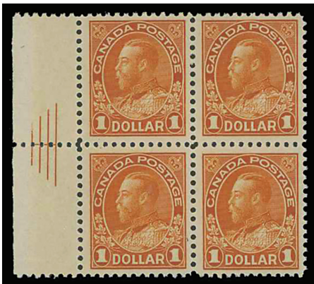
Lot 30 – Realized $4,600