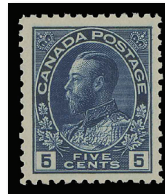
Lot 413 Realized $2,875