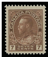
Lot 450 Realized $690