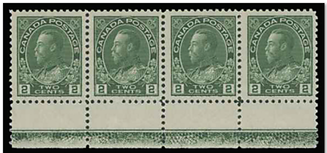
Lot 154 – Realized $12,650