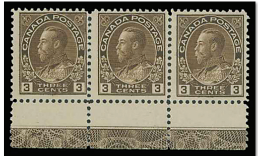
Lot 87 Realized $7,185