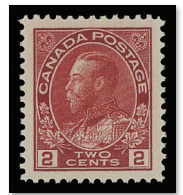
Lot 379 Realized $920