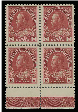
Lot 127 – Realized $9,775