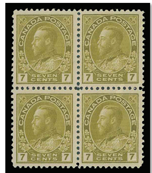
Lot 434 – Realized $5,750