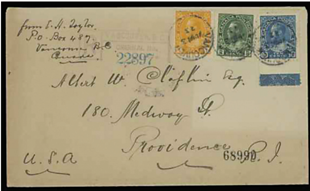
Lot 260 – Realized $2,300