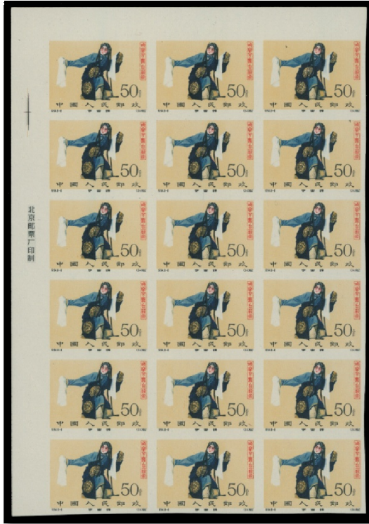
Lot 21 Realized $373,750