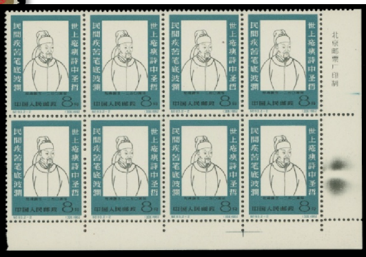
Lot 15 Realized $3,450