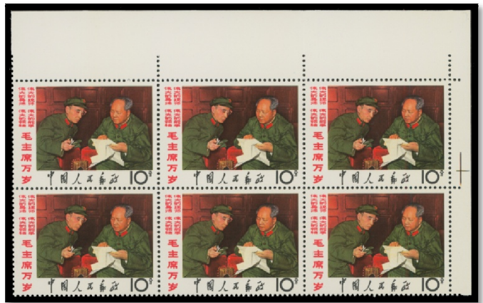
Lot 98 Realized $19,550