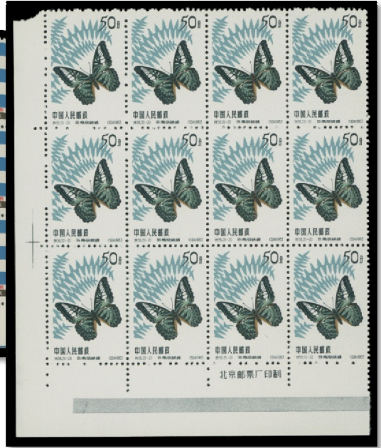
Lot 44 Realized $10,350