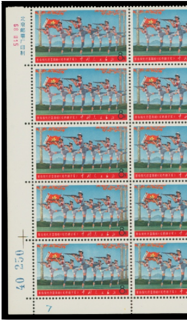
Lot 113 Realized $8,335