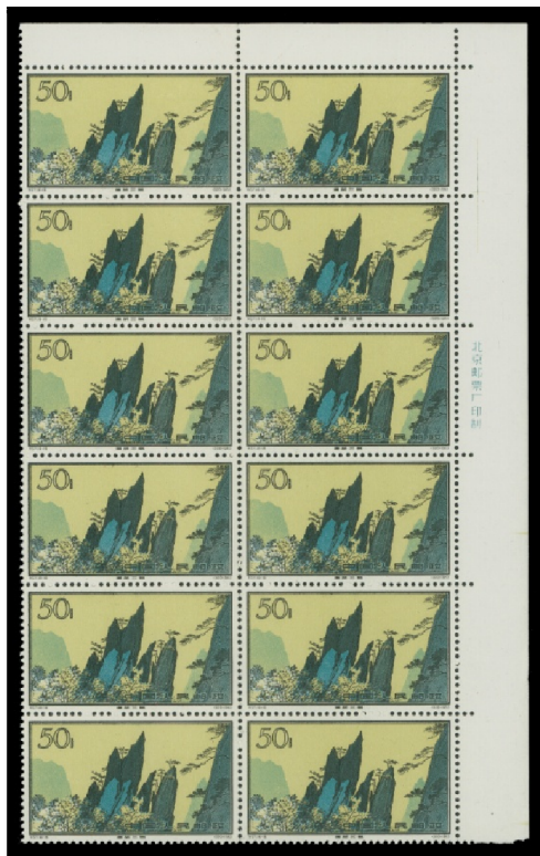
Lot 53 Realized $21,850