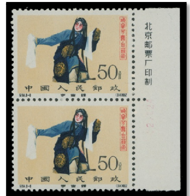
Lot 18 Realized $7,185