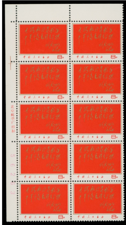
Lot 106 Realized $5,750