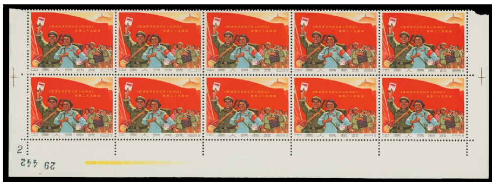
Lot 102 Realized $25,300