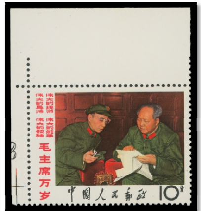
Lot 99 Realized $5,750