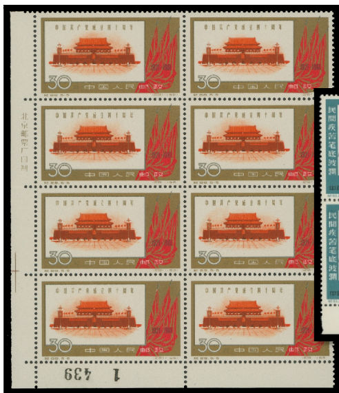
Lot 10 Realized $9,775