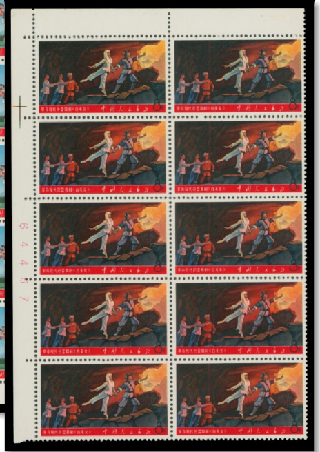
Lot 114 Realized $6,900