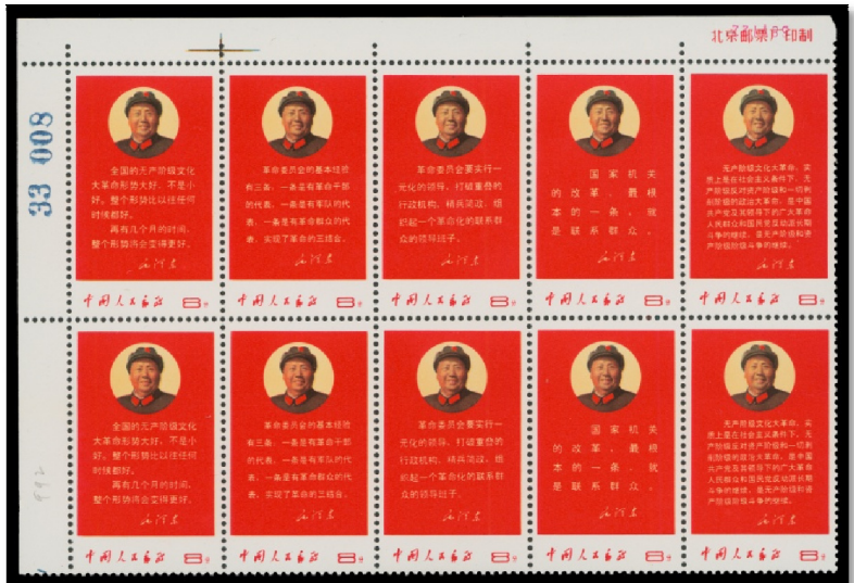
Lot 119 Realized $20,700