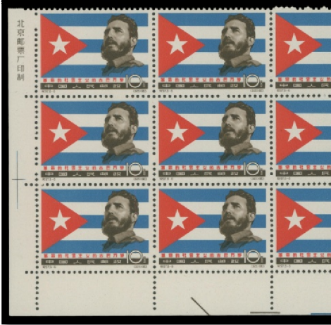
Lot 41 Realized $14,375