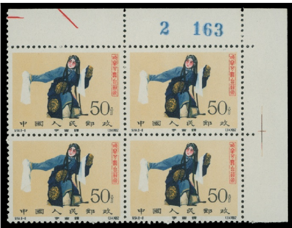
Lot 17 Realized $14,375