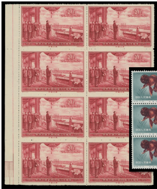
Lot 5 Realized $4,885

Realizations below do not include the 15% buyer's premium.