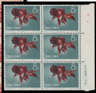
Lot 7 Realized $6,610