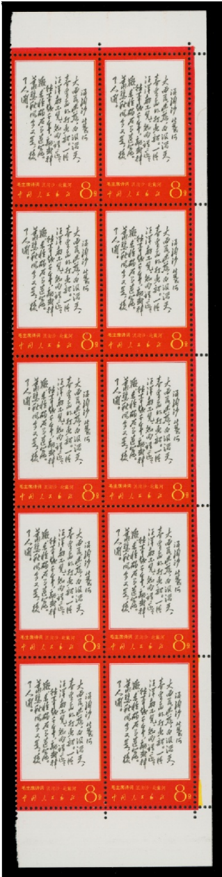
Lot 105 Realized $77,625

Realizations below do not include the 15% buyer's premium.