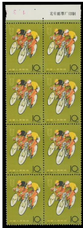
Lot 86 Realized $8,050