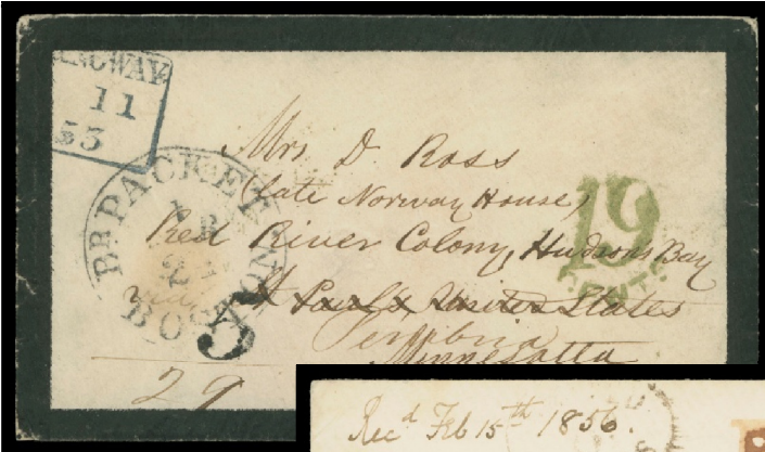
Lot 309 – Realized $4,885