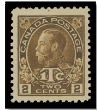
Lot 704 – Realized $3,335