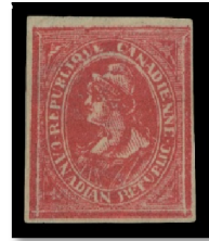
Lot 308 – Realized $1,610