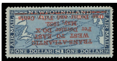
Lot 298 – Realized $26,450