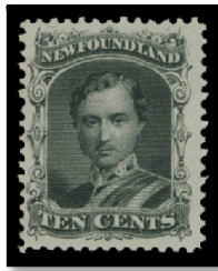
Lot 264 – Realized $1,665