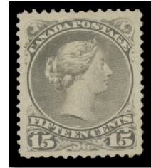
Lot 413 – Realized $2,760