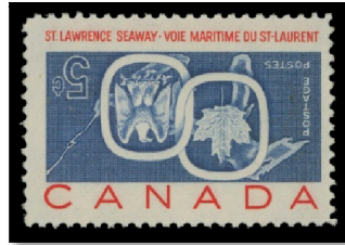
Lot 650 – Realized $10,350