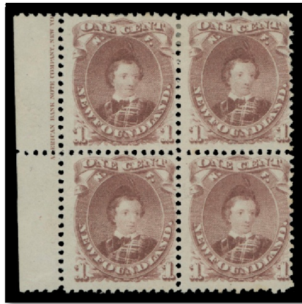
Lot 267 – Realized $975