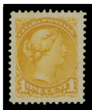
Lot 441 – Realized $1,495

Realizations below do not include the 15% buyer's premium.