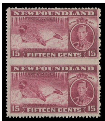
Lot 283 – Realized $2,645

Realizations below do not include the 15% buyer's premium.