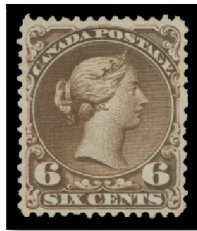
Lot 406 – Realized $4,885