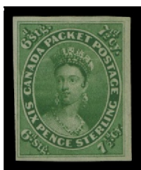
Lot 378 – Realized $10,350