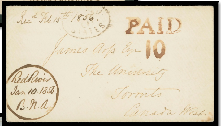
Lot 313 – Realized $9,775