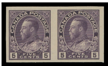
Lot 589 – Realized $4,600