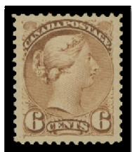
Lot 457 – Realized $4,310