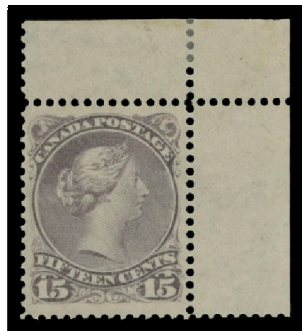
Lot 415 – Realized $6,035