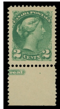
Lot 445 – Realized $6,610