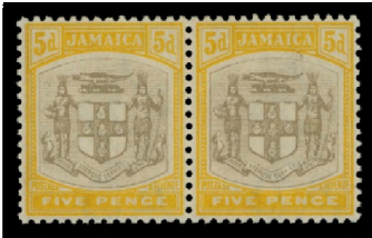
Lot 112 – Realized $1,495