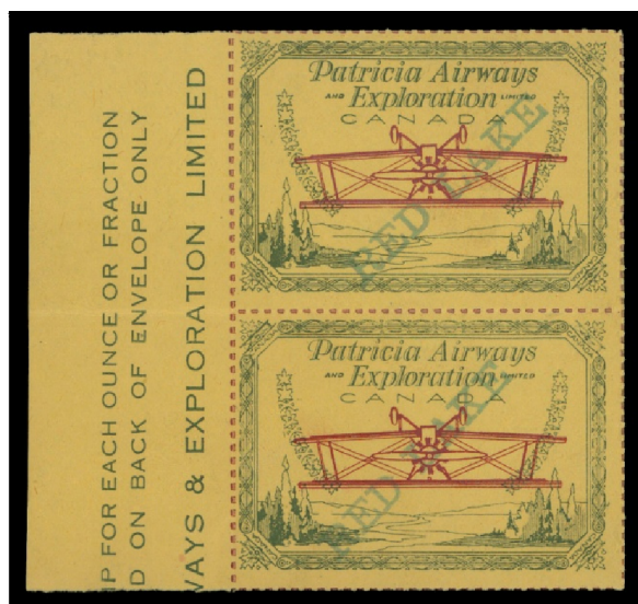
Lot 676 – Realized $4,025

Realizations below do not include the 15% buyer's premium.