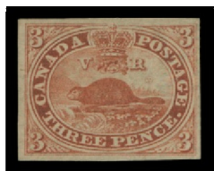
Lot 365 – Realized $2,530