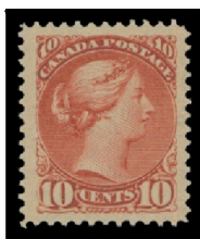
Lot 481 – Realized $4,310