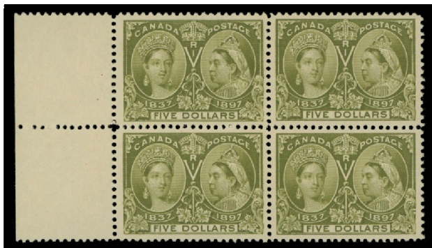
Lot 511 – Realized $7,185