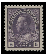
Lot 587 – Realized $370