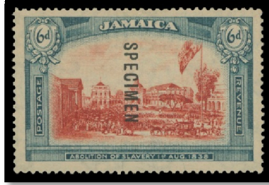
Lot 115 – Realized $975