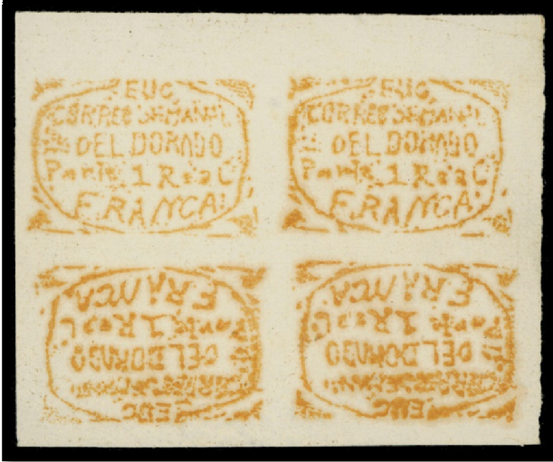
Lot 38 – Realized $10,350

Realizations below do not include the 15% buyer's premium.