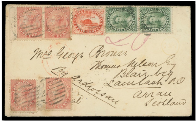
Lot 385 – Realized $5,460