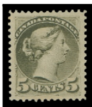
Lot 452 – Realized $4,885