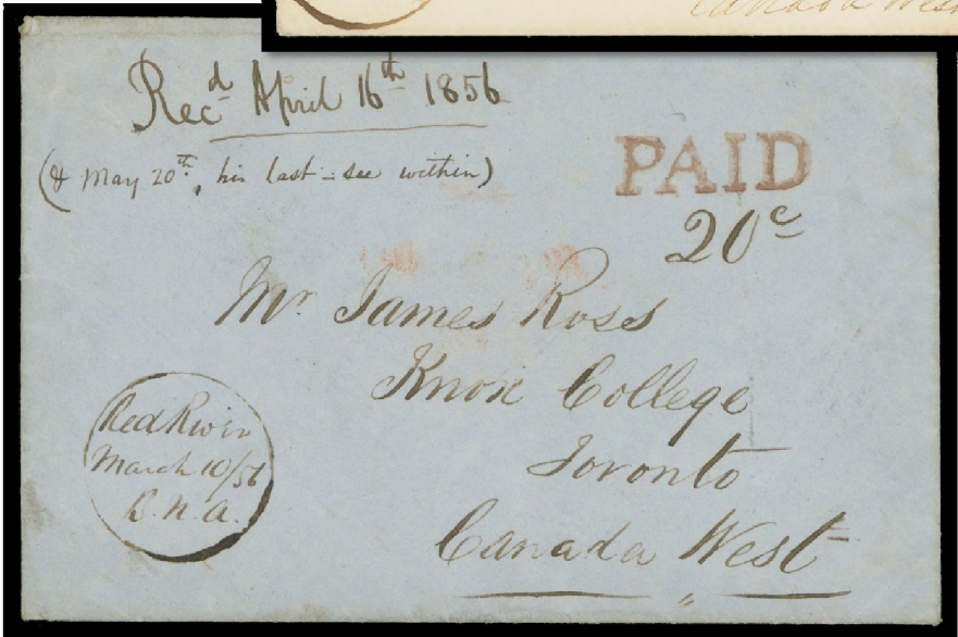
Lot 314 – Realized $20,700