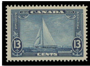
Lot 645 – Realized $1,550