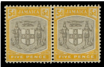
Lot 113 – Realized $1,840