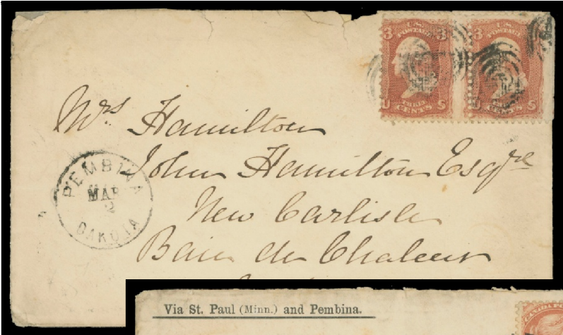
Lot 318 – Realized $4,025