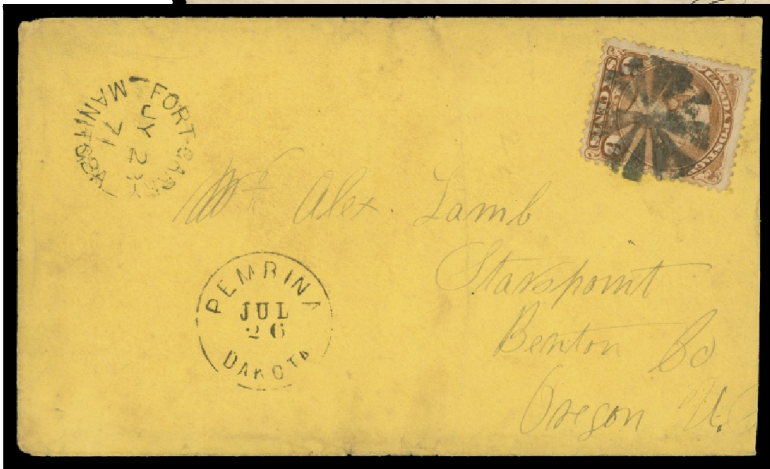
Lot 320 – Realized $2,760