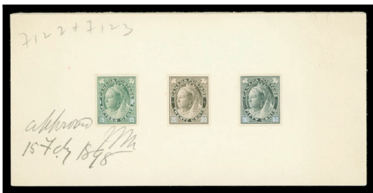
Lot 127 Realized $23,000