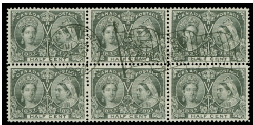
Lot 19 Realized $830