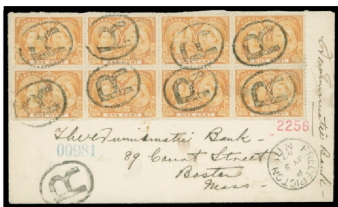
Lot 90 Realized $545