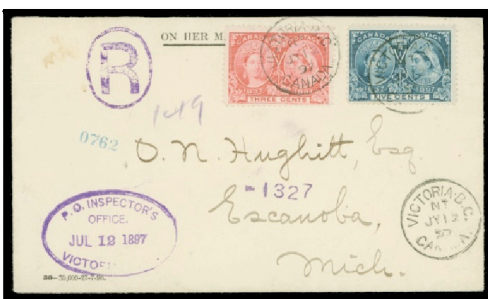
Lot 91 Realized $460