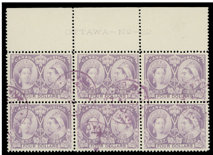
Lot 59 Realized $6,325