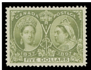
Lot 63 Realized $2,875