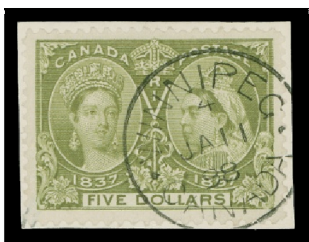
Lot 66 Realized $1,955