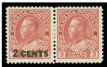
Lot 314 Realized $975