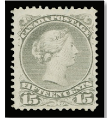
Lot 104 Realized $20,700