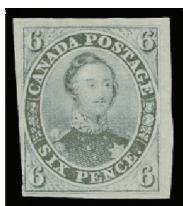
Lot 2 Realized $40,250