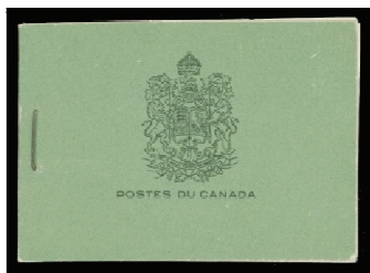
Lot 399 Realized $1,090