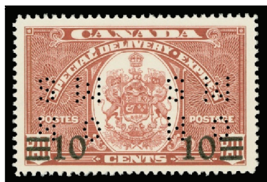
Lot 461 Realized $830