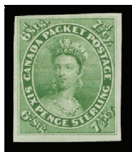
Lot 20 Realized $15,525