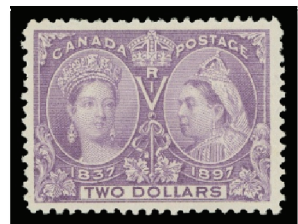
Lot 161 Realized $6,610