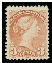
Lot 130 Realized $6,035