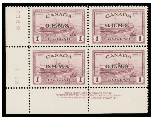
Lot 465 Realized $8,050