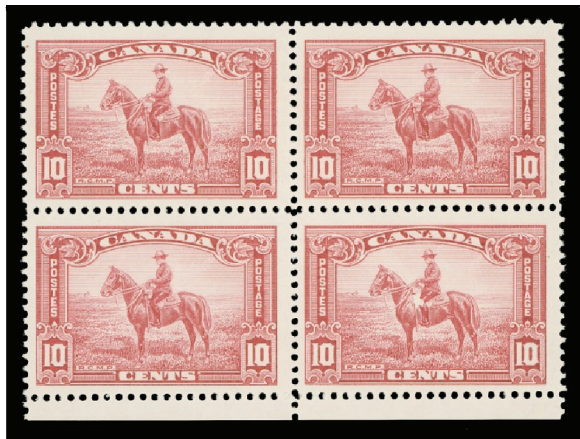
Lot 352 Realized $4,310