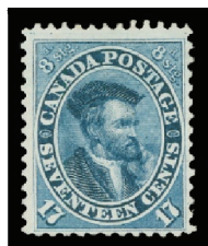
Lot 56 Realized $1,665