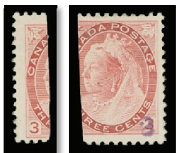
Lot 212 Realized $29,900

Realizations below do not include the 15% buyer's premium.