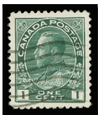
Lot 226 Realized $2,530