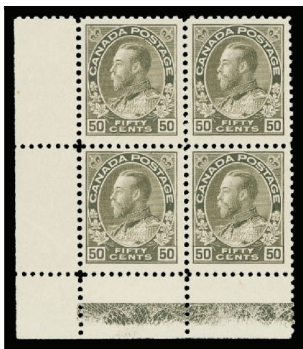
Lot 302 Realized $14,950