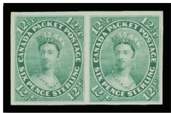
Lot 53 Realized $6,610