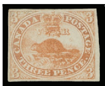
Lot 1 Realized $77,050