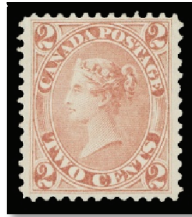
Lot 62 Realized $3,220