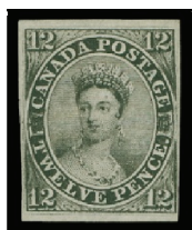
Lot 3 Realized $77,050