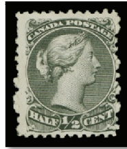
Lot 66 Realized $21,850