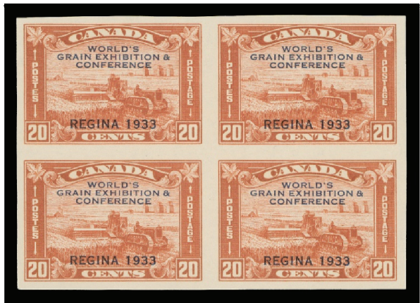
Lot 342 Realized $11,500