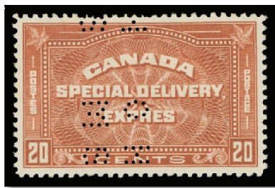
Lot 460 Realized $830