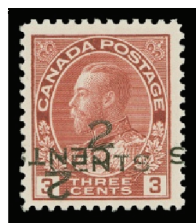
Lot 321 Realized $975