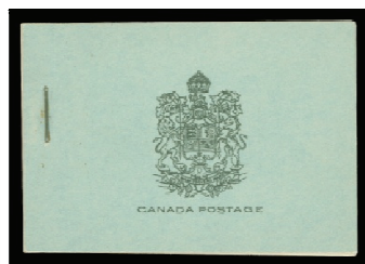
Lot 403 Realized $830