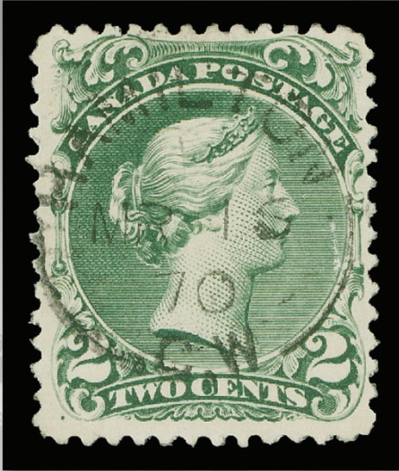
The 2¢ Large Queen Laid Paper

As recently reported in the philatelic press, the existence of a third example of the 2¢ Large Queen on Laid Paper was confirmed. The stamp was discovered in a sales circuit book by a collector. He sent the stamp to the Vincent Graves Greene Foundation for a certificate, who after much study and consultation issued a certificate of genuineness in 2013. A full report can be found on the Foundation's website.