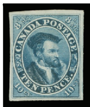
Lot 16 Realized $27,600