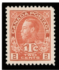
Lot 444 Realized $400