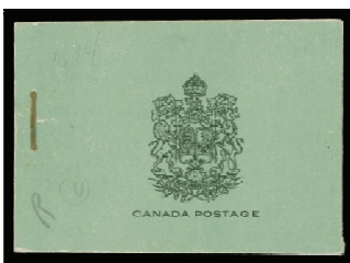
Lot 400 Realized $1,035