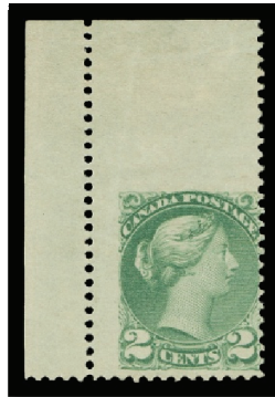
Lot 127 Realized $2,875