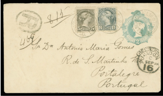
Lot 511 Realized $2,530