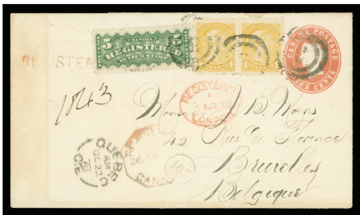
Lot 424 Realized $2,990