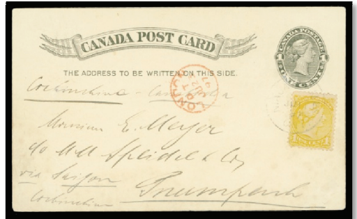
Lot 434 Realized $1,205