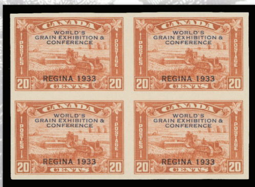
1933 20c Grain Exhibition overprint imperforate NH block, Broken X variety on top right stamp; 2004 Greene cert.