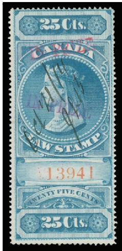
Lot 1127 Realized $9,200