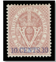
Lot 282 Realized $2,875