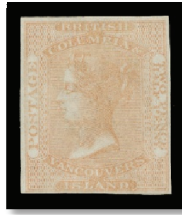
Lot 277 Realized $26,450