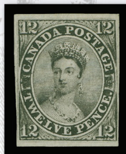
1851 12p black on laid paper sound unused; 2001 Greene cert.