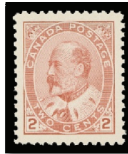
Lot 845 Realized $1,090