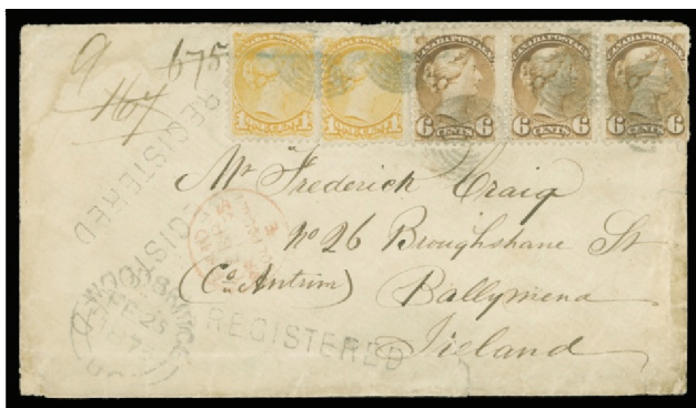
Lot 485 Realized $2,990