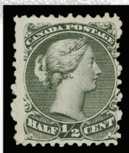
1868 1/2c black watermarked unused; 1998 Greene cert.