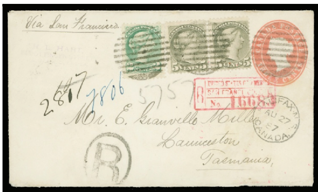
Lot 417 Realized $12,075