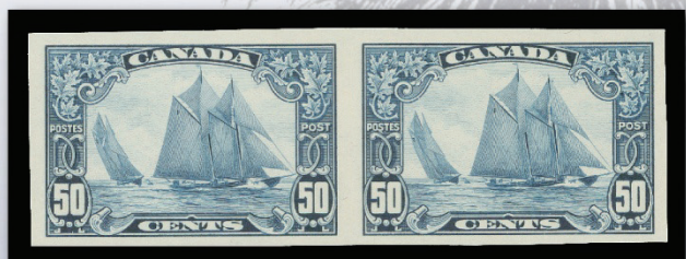
1929 50c Bluenose, mint NH imperforate pair with "Man on the Mast" plate variety; 2000 Greene cert.