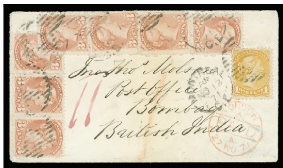
Lot 483 Realized $6,035