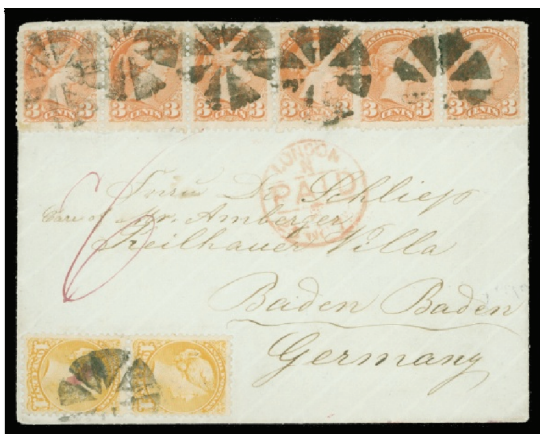
Lot 467 Realized $7,760

Realizations below do not include the 15% buyer's premium.