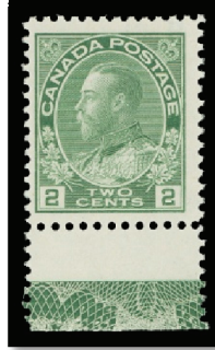
Lot 602 Realized $1,610