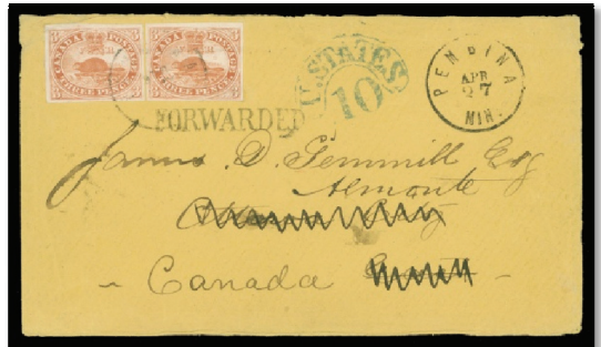
Lot 720 Realized $21,850