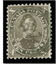
Lot 751 Realized $9,775