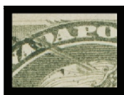
Lot 767 Realized $1,150