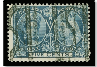
Lot 1121 Realized $430