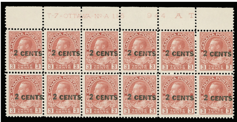
Lot 591 Realized $1,840