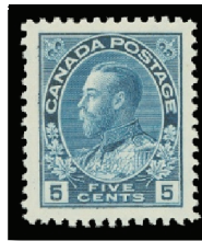
Lot 903 Realized $1,320