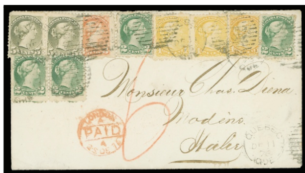
Lot 487 Realized $8,050