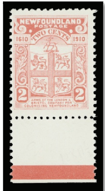
Lot 345 Realized $1,035