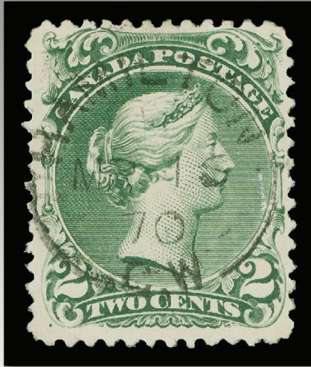
The 2¢ Large Queen Laid Paper

As recently reported in the philatelic press, the existence of a third example of the 2¢ Large Queen on Laid Paper was confirmed. The stamp was discovered in a sales circuit book by a collector. He sent the stamp to the Vincent Graves Greene Foundation for a certificate, who after much study and consultation issued a certificate of genuineness in 2013. A full report can be found on the Foundation's website.