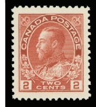
Lot 883 Realized $430