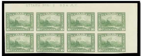
Lot 971 Realized $2,990