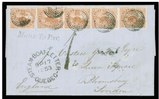
Lot 721 Realized $9,200