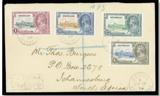
Lot 231 Realized $4,310