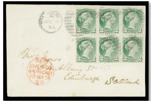
Lot 535 Realized $2,645