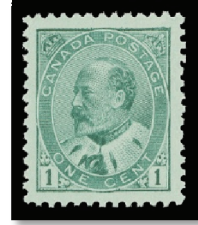
Lot 841 Realized $460