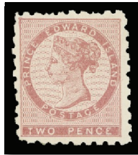
Lot 315 Realized $1,610