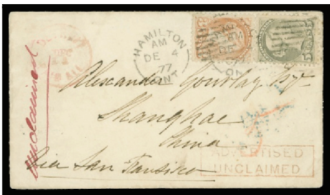
Lot 438 Realized $5,750