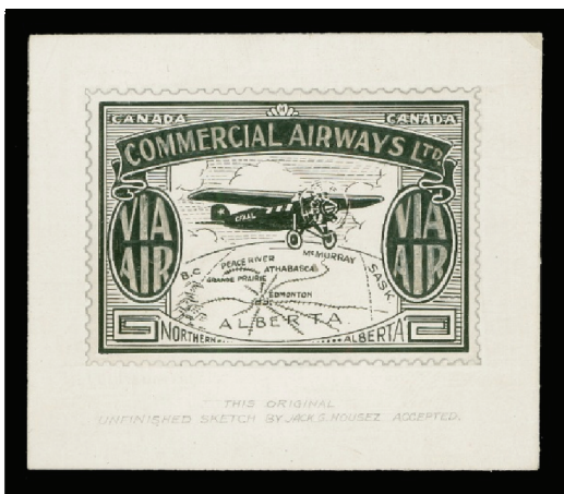
Lot 1059 Realized $2,185