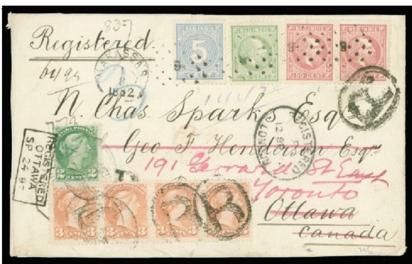
Lot 449 Realized $2,990