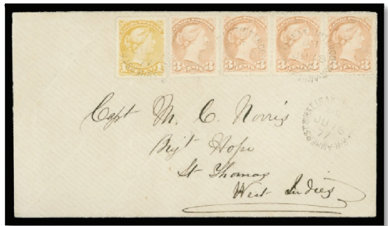
Lot 445 Realized $4,885