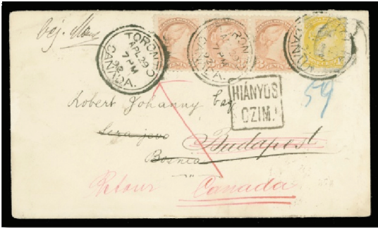
Lot 428 Realized $2,760