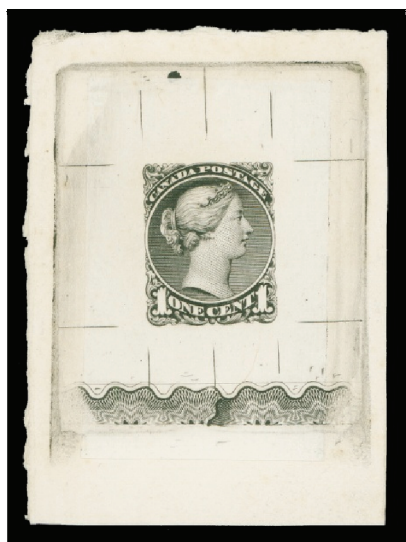
Lot 761 Realized $26,450