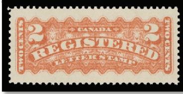
Lot 1078 Realized $1,955