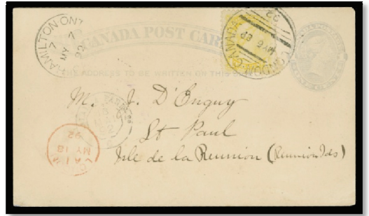
Lot 512 Realized $1,380