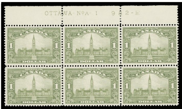
Lot 980 Realized $4,885

Realizations below do not include the 15% buyer's premium.