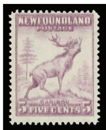
Lot 381 Realized $630

Realizations below do not include the 15% buyer's premium.