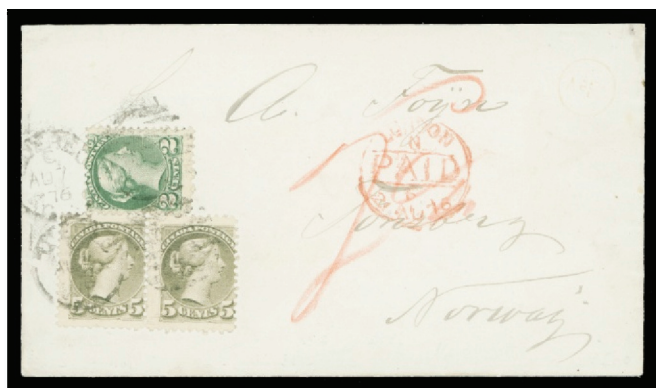
Lot 505 Realized $4,600