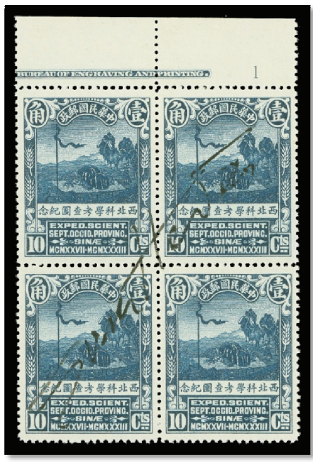
Lot 51 Realized $1,200

Realizations below do not include the 15% buyer's premium.