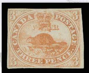
1851 3p red on laid paper sound mint OG; 2001 PF cert.

Our May 2014 auction will feature this outstanding collection of Canadian singles. The owner made a serious attempt to acquire every Unitrade listed variety in mint condition. Rare and elusive stamps from the first pence issue to back of the book abound.