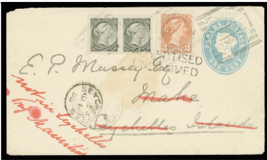
Lot 514 Realized $3,735