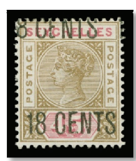
Lot 218 Realized $1,265