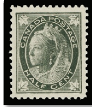
Lot 790 Realized $400