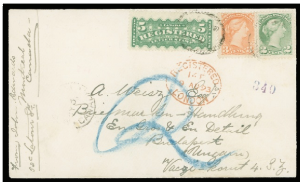
Lot 481 Realized $4,885