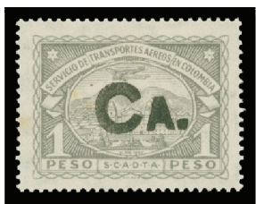
Lot 1068 Realized $460