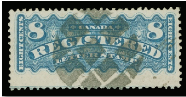
Lot 1080 Realized $600