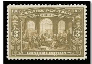
Lot 949 Realized $400