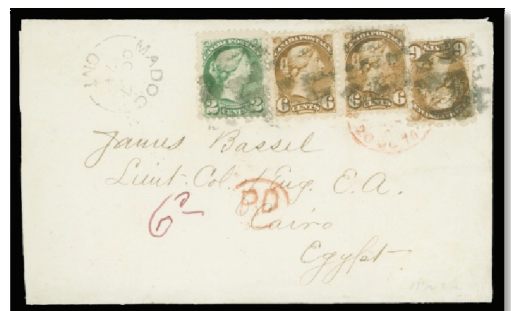
Lot 454 Realized $5,460