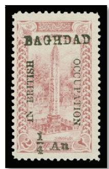
Lot 167 Realized $400