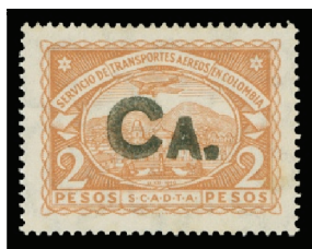
Lot 1069 Realized $460