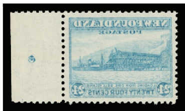
Lot 387 Realized $575