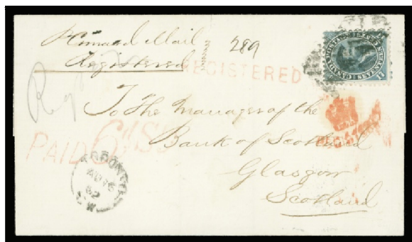
Lot 756 Realized $4,600

Realizations below do not include the 15% buyer's premium.