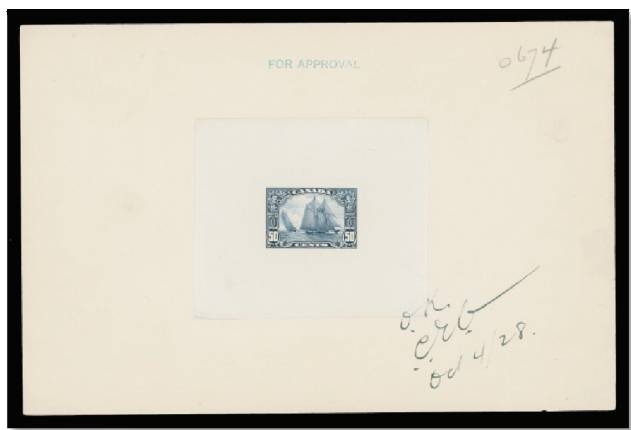
Lot 1315 Realized $20,700