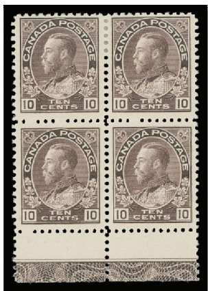
Lot 1042 Realized $6,610