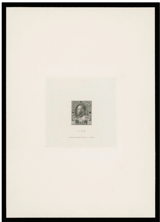
Lot 1004 Realized $4,025

Realizations below do not include the 15% buyer's premium.