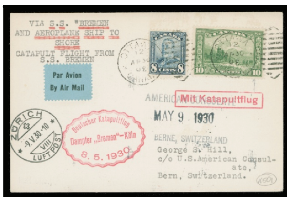
Lot 1360 Realized $4,025