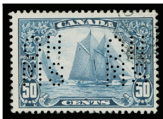
Lot 1350 Realized $1,320