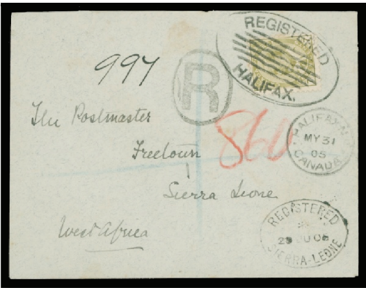
Lot 1264 Realized $775