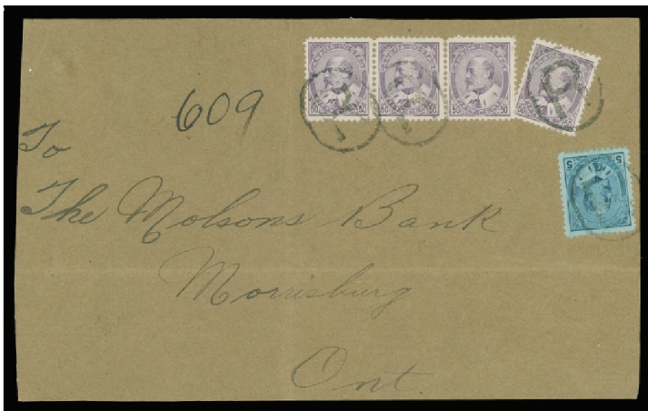
Lot 1277 Realized $4,600