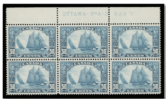
Lot 1316 Realized $4,885