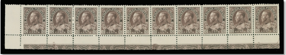
Lot 1041 Realized $9,200