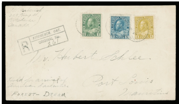
Lot 1090 Realized $830