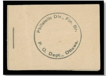
Lot 1341 Realized $4,025