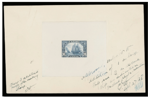
Lot 1314 Realized $17,250

Realizations below do not include the 15% buyer's premium.