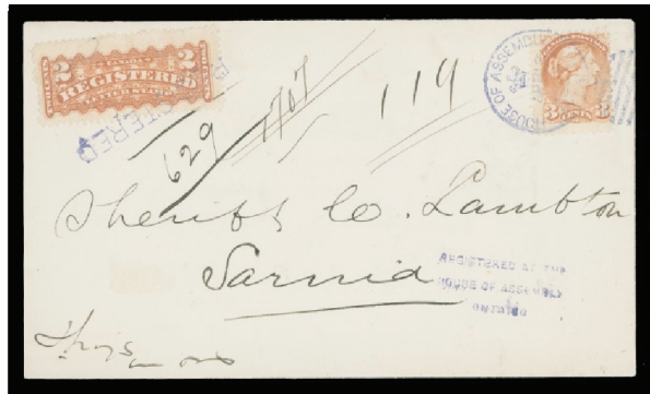
Lot 1224 Realized $1,265