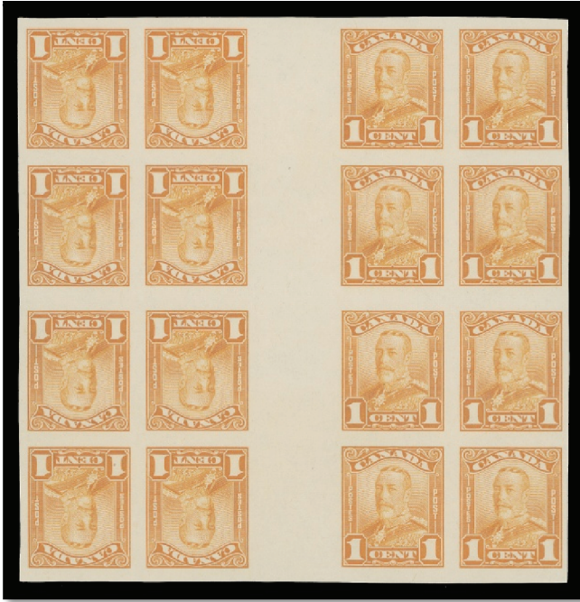
Lot 1292 Realized $10,925