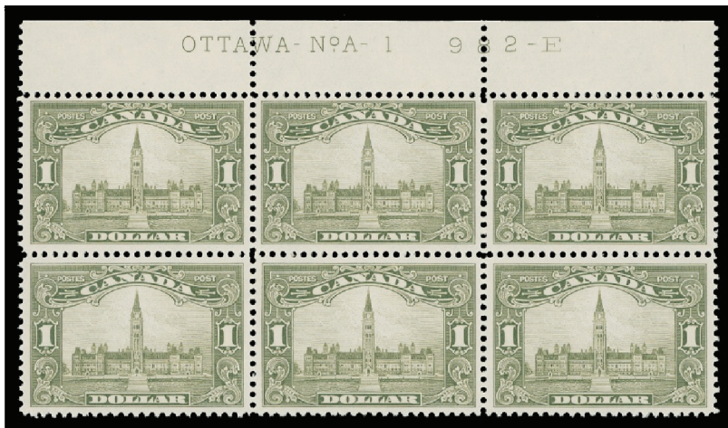
Lot 1332 Realized $4,885