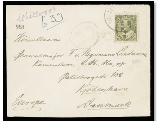
Lot 1272 Realized $4,885