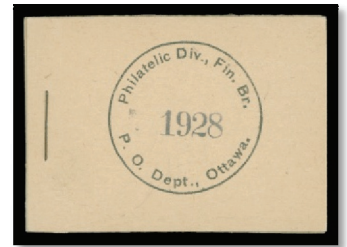
Lot 1342 Realized $6,035