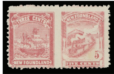
Lot X259 Realized $1,495