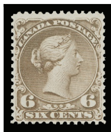
Lot 348 Realized $4,310