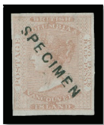
Lot 74 Realized $8,652