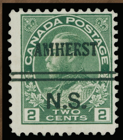
Two cent green Admiral. The only known example.