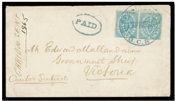
Lot 85 Realized $4,310