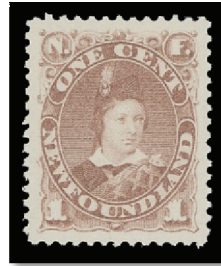
Lot 253 Realized $515