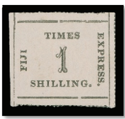
Lot 16 Realized $1,550

Realizations below do not include the 15% buyer's premium.