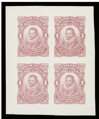
Lot X267 Realized $9,775

Realizations below do not include the 15% buyer's premium.