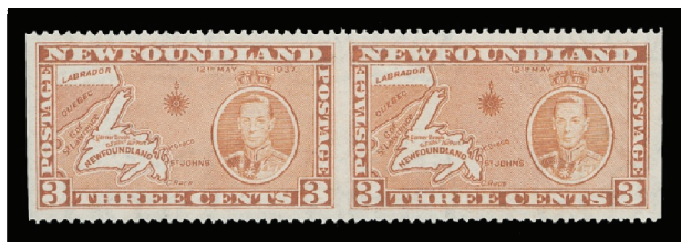
Lot 284 Realized $1,840