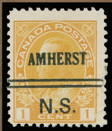
One cent yellow Admiral, Die I. Only two examples known.

One of the highlights of this famous collection.