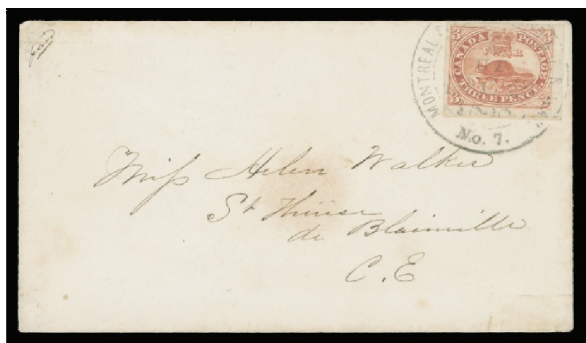
Lot 330 Realized $6,035