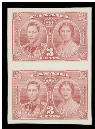
Lot 453 Realized $1,320