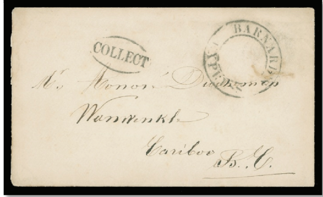
Lot 94 Realized $4,025