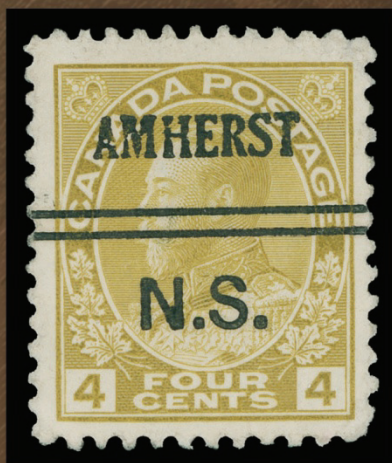
Four cent olive bistre Admiral. Only three examples known.