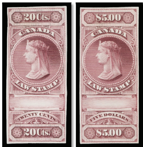
Lot X570 Realized $2,530