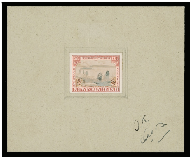
Lot 1220 Realized $1,665