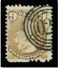
Lot 1600 Realized $430