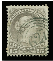
Lot 1578 Realized $430