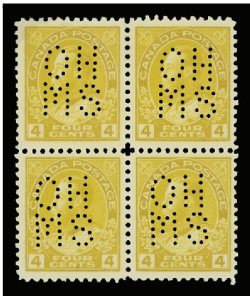
Lot 1760 Realized $1,725