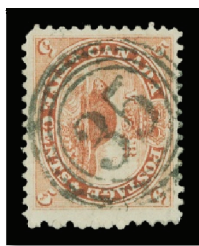
Lot 1536 Realized $7,760