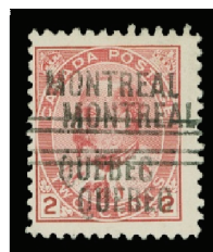
Lot 1335 Realized $322