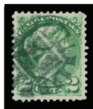
Lot 1419 Realized $195