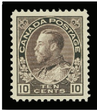
Lot 1661 Realized $1,610