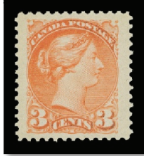
Lot 1605 Realized $975