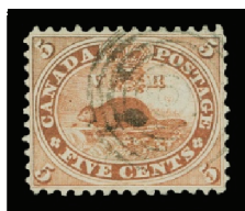
Lot 1539 Realized $2,875