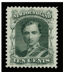
Lot 1186 Realized $1,435