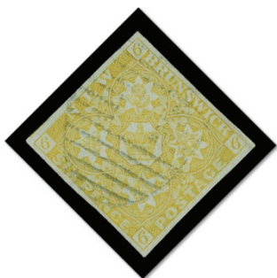
Lot 1141 Realized $1,840

Realizations below do not include the 15% buyer's Premium.