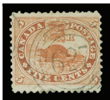
Lot 1537 Realized $660