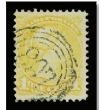
Lot 1586 Realized $460