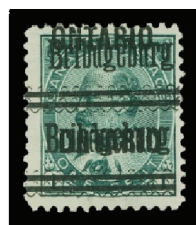
Lot 1305 Realized $373