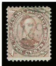
Lot 1547 Realized $430