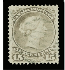
Lot 1575 Realized $430