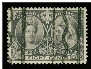
Lot 1279 Realized $373