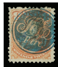
Lot 1433 Realized $333