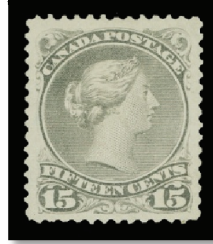
Lot 1574 Realized $2,530