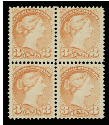
Lot 1594 Realized $3,105