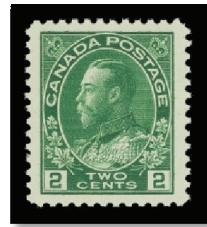
Lot 650 – Realized $370