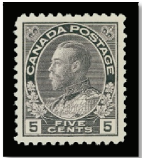
Lot 664 – Realized $660