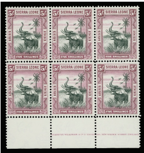
Lot 327 – Realized $5,175