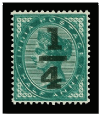
Lot 180 – Realized $545