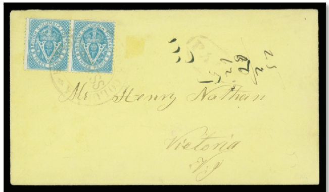
Lot 487 – Realized $1,955