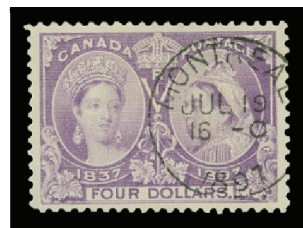
Lot 618 – Realized $3,220