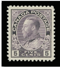
Lot 665 – Realized $660