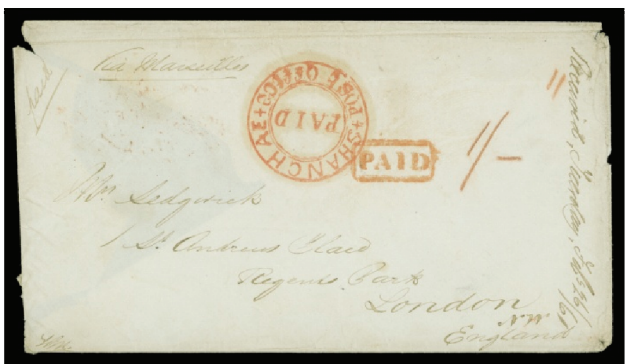
Lot 168 – Realized $23,000