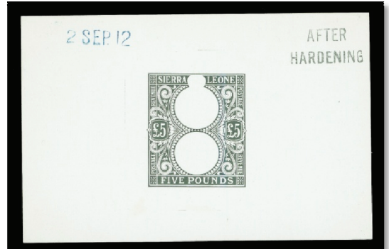
Lot 317 – Realized $1,435