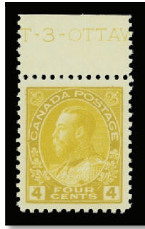
Lot 659 – Realized $1,435