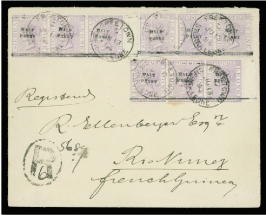
Lot 281 – Realized $2,185