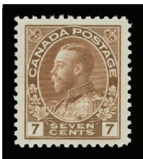
Lot 668 – Realized $1,840