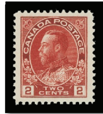
Lot 649 – Realized $460