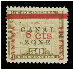
Lot 440 – Realized $2,645