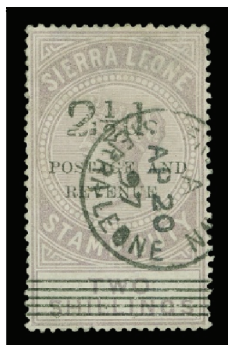
Lot 302 – Realized $3,220