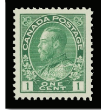
Lot 640 – Realized $430