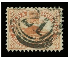
Lot 594 – Realized $2,645