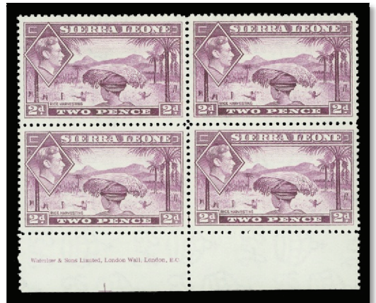
Lot 341 – Realized $2,645