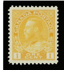
Lot 646 – Realized $460