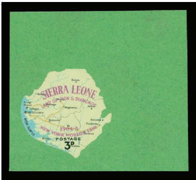
Lot 344 – Realized $660