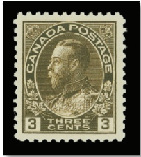
Lot 656 – Realized $460

Realizations below do not included the 15% buyer's Premium.