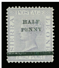
Lot 280 – Realized $1,265