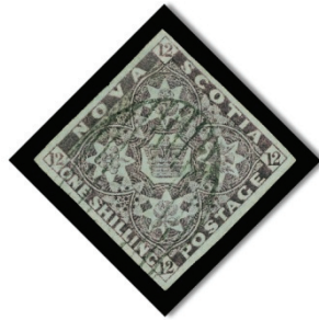
Lot 516 – Realized $7,185