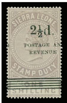
Lot 300 – Realized $2,300