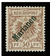
Lot 96 – Realized $2,415

Realizations below do not included the 15% buyer's Premium.