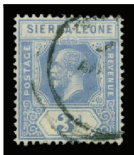
Lot 320 – Realized $920