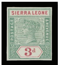
Lot 287 – Realized $805

Realizations below do not include the 15% buyer's Premium.