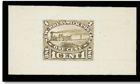
Lot 18 – Realized $2,100