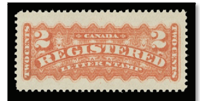
Lot 306 Realized $1,450