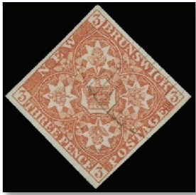
Lot 10 – Realized $850