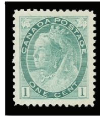
Lot 197 Realized $325