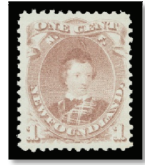
Lot 62 – Realized $1,200