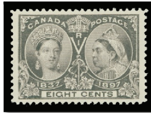
Lot 181 Realized $525