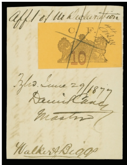
Lot 325 – Realized $475

*Realizations do not include the 15% buyer's Premium.