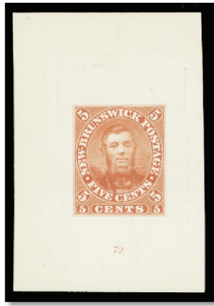
Lot 16 – Realized $2,400