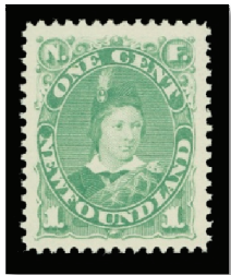
Lot 68 – Realized $160