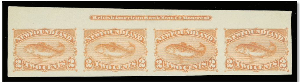
Lot 69 – Realized $1,700