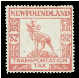
Lot 110 Realized $3,250