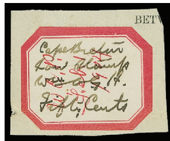
Lot 327 – Realized $2,100

*Realizations do not include the 15% buyer's Premium.