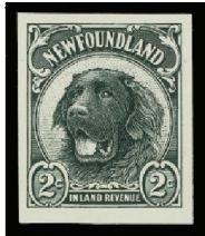
Lot 111 Realized $475